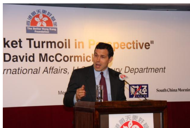
Mr. David McCormick sharing with the audiences his views on the recent global financial turmoil and the way forward

Mr. McCormick also shared his views on the root cause of the market turmoil, the measures that the United States is taking to mitigate risk as well as to stabilize the markets, and suggested some possible early lessons for both the United States and China. Four emerging themes have been suggested by Mr. McCormick, namely the reformation of US financial system, development of domestic market, anti-protectionism and the continuation of cooperation among government around the world. Although the interdependence of the global economy has made the current challenges more complex, Mr. McCormick believed that the challenge would be overcome with the joint effort of the world leaders.