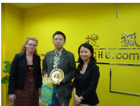
Meeting with Dr. Charles Zhang, Founder and Chairman & Chief Executive Officer of SOHU.com