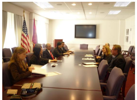
Meeting with the U.S. Department of Commerce

for Strategic & International Studies, Carnegie Endowment for International Peace, The CATO Institute, The Heritage Foundation, East-West Center, The U.S.-Asia Institute, etc); think-tanks in New York City (The National Committee on U.S.-China Relations and the Asia Society); professional bodies (American Bar Association); financial institutions (Morgan Stanley); rating agencies (Standard & Poor's) and media representatives.