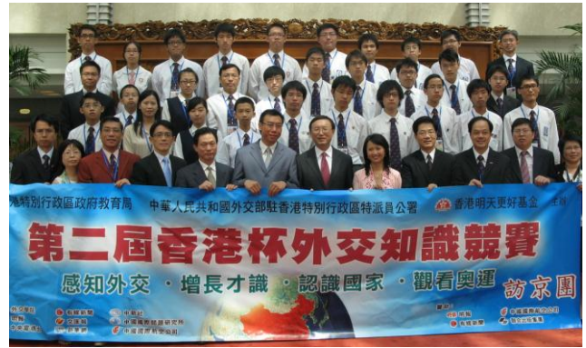
The Study Tour visited the Ministry of Foreign Affairs and was received by Mr. Yang Jiechi, Minister of Foreign Affairs (7th right)