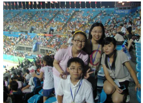
Enjoying the Olympic beach volleyball games

The delegation was grateful for the hospitality of the Ministry of Foreign Affairs and the University, and was thrilled by the Olympic Games ambience in Beijing. Their thoughts and comments on the trip are now available at the website of the Commissioner's Office of China's Foreign Ministry in the HKSAR http://big5.fmprc.gov.cn/gate/big5/quiz.fmcoprc.gov.hk/chn/ .