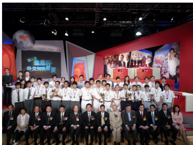
Group photo of guests and winning teams