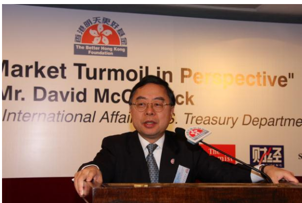
Mr. Ronnie Chan, Chairman of the Executive Committee of the Foundation introducing the honorable speaker Mr. David McCormick to the audience

Organized by the Better Hong Kong Foundation, Mr. David McCormick, Under Secretary for International Affairs of the U.S. Treasury Department delivered a luncheon speech entitled "Financial Turmoil in Perspective" at the Renaissance Harbour View Hotel in Hong Kong on 22 October 2008. More than 300 audiences who are professionals from financial and banking sectors, insurance and properties industries, academic and the government, etc attended the luncheon.