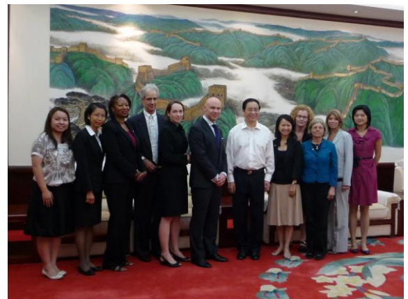
Meeting with Mr. Liu Mingkang (6th right), Chairman of China Banking Regulatory Commission

Before the study tour, the delegation attended seminars in Honolulu where experts on China and Hong Kong issues were invited to give an overview on the two places. With the support of the Ministry of Foreign Affairs, the Better Hong Kong Foundation organized the study program to China and Hong Kong. On 16 September 2008, the delegation arrived in Beijing where they began their journey in China. To get a feel for the city, a sightseeing tour, including visiting the Great Wall and the Forbidden City, was held on the next day. The journalists were amazed and fascinated by both the historic and the state-of-the-art buildings in Beijing.