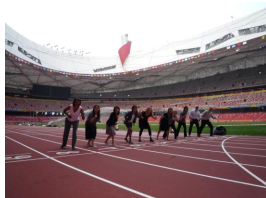
Visit to Bird’s Nest