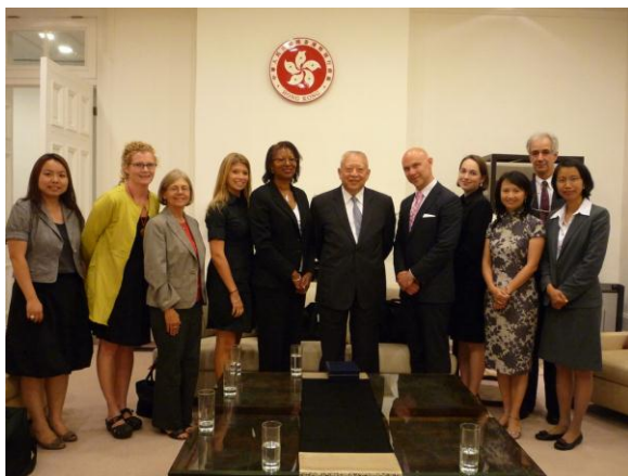
Meeting Mr. Tung Chee-hwa at the Office of the Former Chief Executives

The Foundation hosted a dinner at the Dynasty