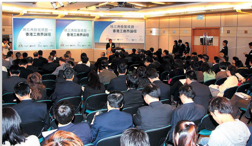
Over 180 professionals from various business fields attending the forum

Initiated by the Better Hong Kong Foundation (the Foundation), and joined by the Central Policy Unit of the HKSAR Government (CPU) and the Federation of Hong Kong Industries (FHKI), the Hong Kong Business Community Forum on the Pearl River Delta Development Plan was successfully held on 27 March 2009 at the City University of Hong Kong. More than 180 professionals from various business fields attended the Forum. The Chinese Manufacturers' Association of Hong Kong (CMA) and City University of Hong Kong (CityU) were the co-organizers and the media partner was the Hong Kong Economic Times.