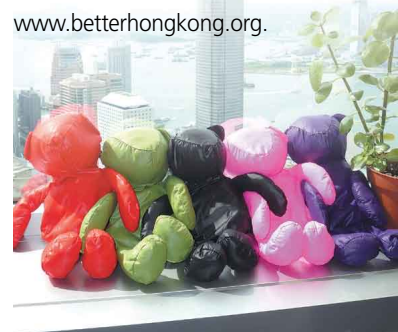
The Foundation specially arranged environmental-friendly teddy bags as souvenirs for this trip

A detailed itinerary and more photos can be found at the Foundation's website www.betterhongkong.org .