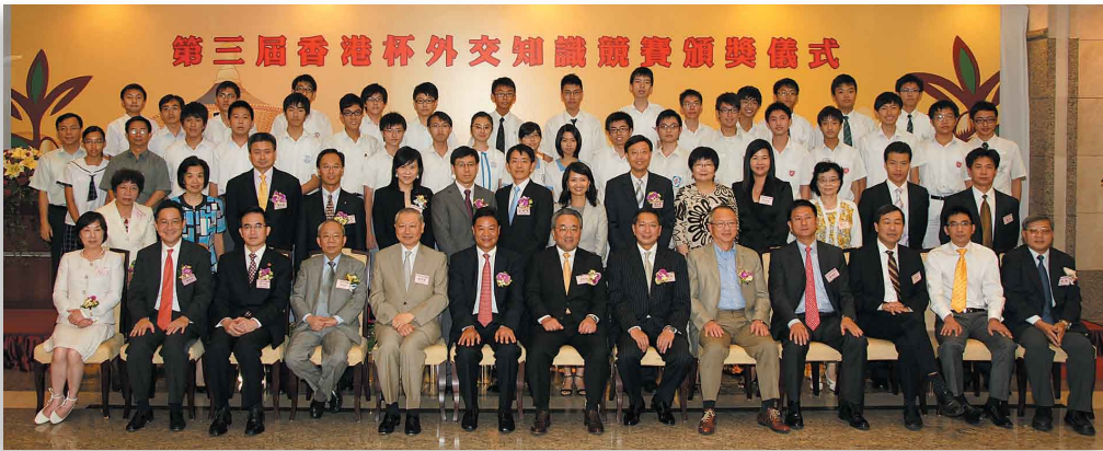
Group photo of guests and winning teams after the prize presentation ceremony