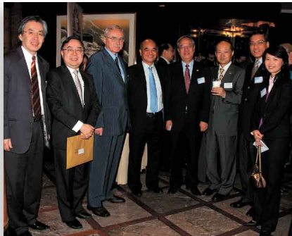
The Better Hong Kong Foundation's Spring Luncheon