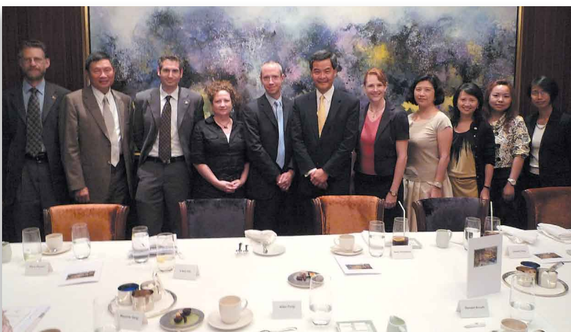
Mr. C Y Leung, Convenor of the Executive Council of the HKSAR (6th right) hosting a luncheon where members of the Executive Council also participated