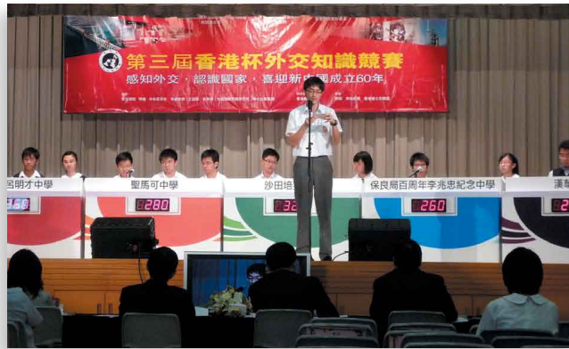
The scenario improvisation section is a challenge to the contestant at the Semi-final