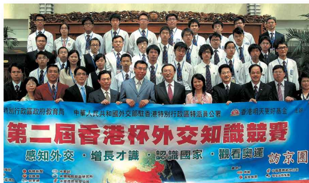
The study tour visited the Ministry of Foreign Affairs and was received by Mr. Yang Jiechi, Minister of Foreign Affairs (6th right)