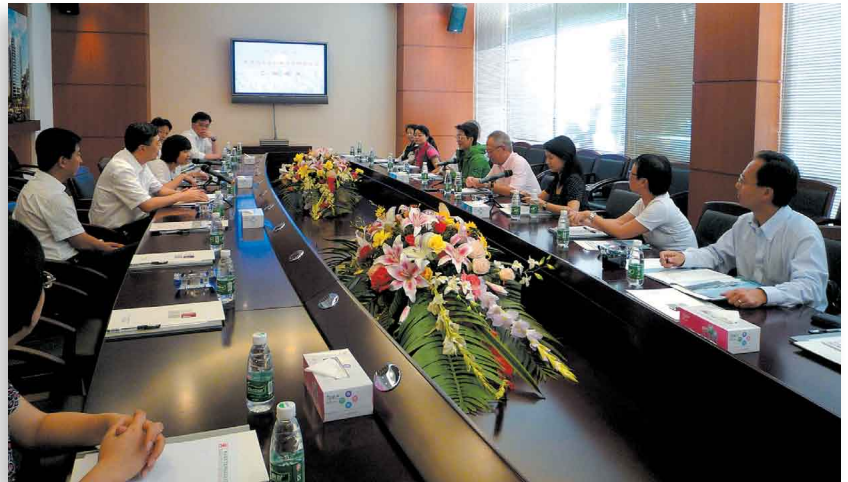
Meeting with representatives of Tian An Hi-tech Ecological Park