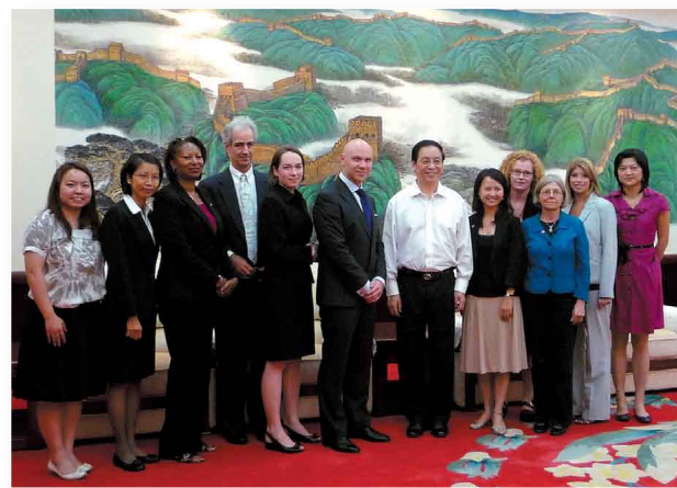
Meeting with Mr. Liu Mingkang (6th right), Chairman of China Banking Regulatory Commission

Study Tour to Beijing for the Winners of the 2nd Hong Kong Cup Diplomatic Knowledge Contest