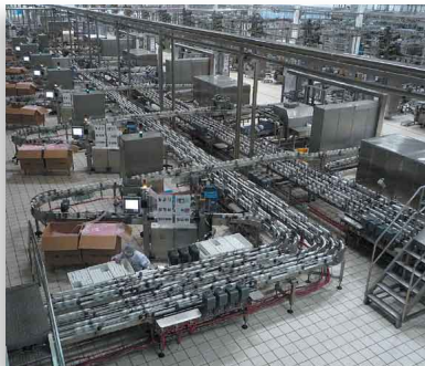
Visit the production plant of Yili Group

grasslands as well as the first national forest park in Hailera. On its last night in Inner Mongolia, the group enjoyed a fantastic outdoor performance of the life of Genghis Khan on the grasslands.