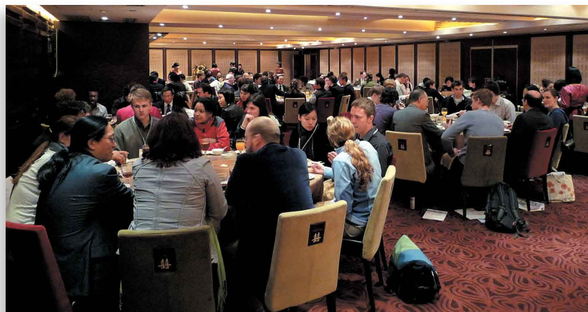
The Foundation hosting a luncheon for about a hundred American Fulbright scholars

the Foundation for Scholarly Exchange in Taiwan and the U.S. Consulate in Hong Kong, and also supported by 8 local universities.