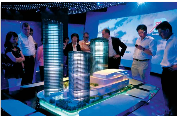
Visit the showroom of Taikoo Hui