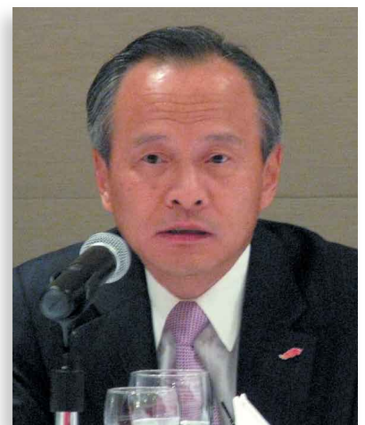
Ambassador Cui Tiankai shared his views on Sino-Japanese relations