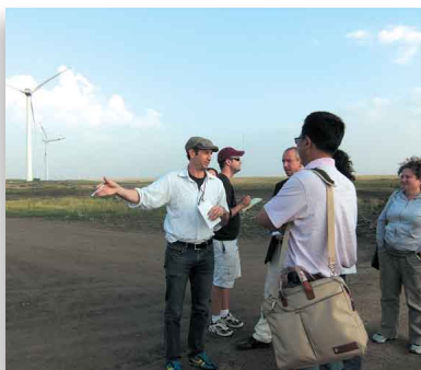
Visit the wind power field