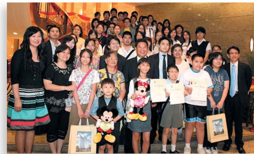
Winners of the open category

A Public Group Contest for this year's Diplomatic Knowledge Contest was held from 10 to 30 May 2009. Over 7,000 contest papers were handed out, and 106 winners emerged. The winners ranged from civil servants, lawyers, taxi drivers, business people, teachers,