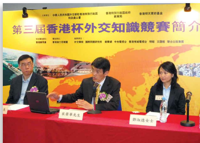
Regulations and prizes of the contest are introduced to the students at the first briefing

a written test. A total of 20 secondary schools were then shortlisted for the semi-final at the end. Within 30 minutes, they were required to complete the written test which covered a wide range of contents, including the history of foreign diplomatic affairs of the PRC, Hong Kong-related foreign affairs, national and international