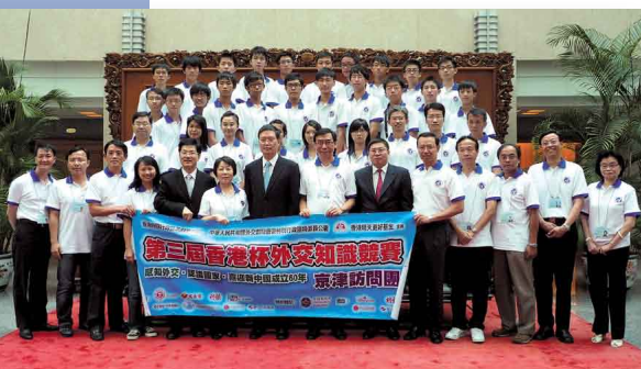
The 3rd Hong Kong Cup Diplomatic Knowledge Contest

Economics, Chinese Academy of Social Sciences and the Hong Kong Institute of Asia-Pacific Studies, the Chinese University of Hong Kong) in April, we have organized two seminars and a visit to deliberate the positioning of Hong Kong in response to the release of the "Outline of the Plan for the Reform and Development of the Pearl River Delta 2008-2020" ("the Outline") in January and Shanghai's plan to become an international financial center by 2020.