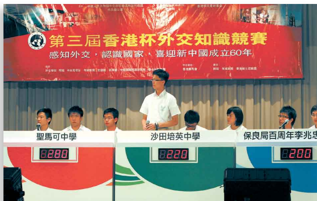
Student competing in the "must-answer questions" session

In August 2009, they were invited to join a study tour to Beijing and Tianjin where they would meet diplomats at the Ministry of Foreign Affairs, see tourist attractions in Beijing and experience the development in Beijing and Tianjin. The remaining shortlisted 15 teams would join another study tour to the Pearl River Delta region in October.