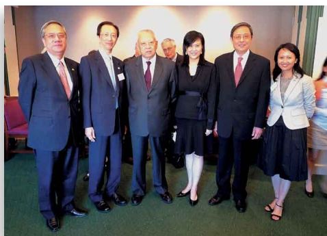
The Better Hong Kong Foundation Annual Delegation to the United States

Other than the annual luncheon and press conference on the "China Urban Competitiveness Report" (organized with the Institute of Finance and Trade