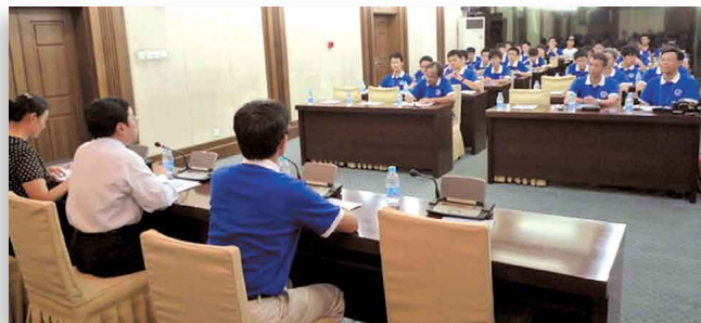
Visit the China Foreign Affairs University

the Vice Foreign Minister Mr. He Yafei at the Ministry of Foreign Affairs where they also had exchanges with leading officials of the Department of Hong Kong,