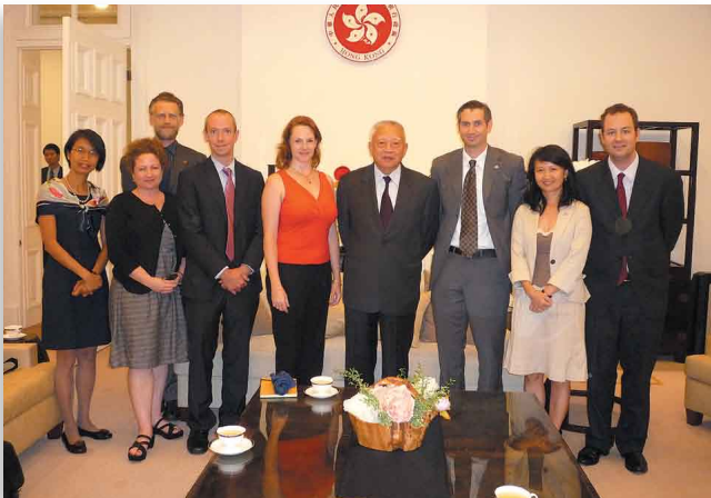
Meeting with Mr. Tung Chee-hwa, the first Chief Executive of the HKSAR and now the Vice Chairman of Chinese People's Political Consultative Conference (4th right)