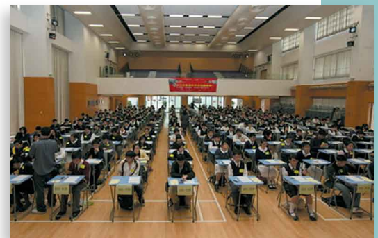
A total of 135 secondary schools sent their teams to participating in the First Round competition

A total of 135 secondary schools of which 46 never participating previously in the contest submitted application. It set a new record for the number of schools applying for the contest. On 28 March 2009, they attended the first round competition which was in the form of