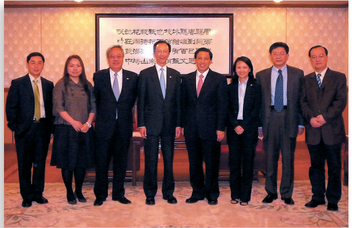
Group photo with Ambassador Zhang Yesui (4th right) at the Permanent Mission of the PRC to the UN

During the mission in New York, Mr. Antony Leung gave a speech entitled “China and Hong Kong: Post Financial Tsunami” at a luncheon hosted by the Asia Society. More than one hundred people attended. (The speech is available on the Foundation’s website www.betterhongkong.org .) In Washington D.C., Mr. Leung spoke at the Fund for American Studies, sharing his views on China and Hong Kong’s Economic Outlook. Mr. Leung was also Chair of the Panel on the session “Working Towards Economic Recovery and International Balance” at the Harvard Conference – Power and Restraint: Perspectives on the U.S. and Chinese Relationship.