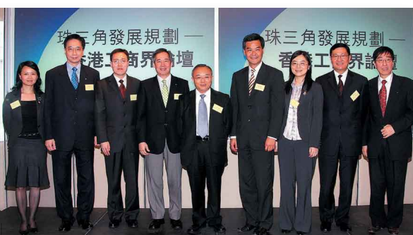
Hong Kong Business Community Forum on the Pearl River Delta Development Plan