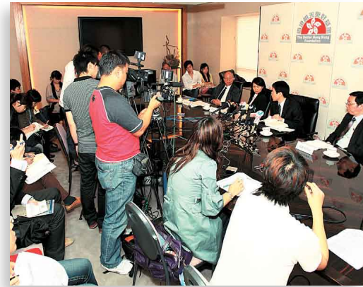
The press conference is well attended by the media