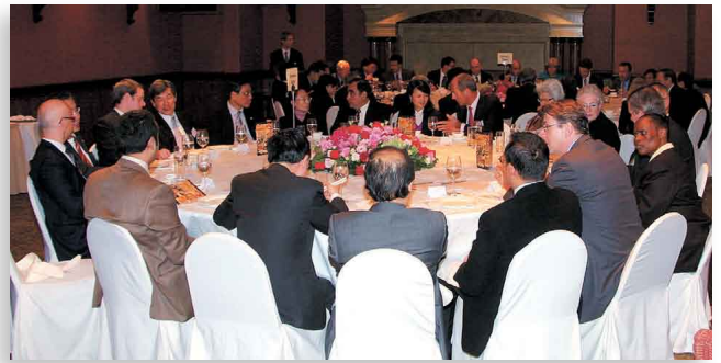
Over 30 guests attending the Spring Luncheon