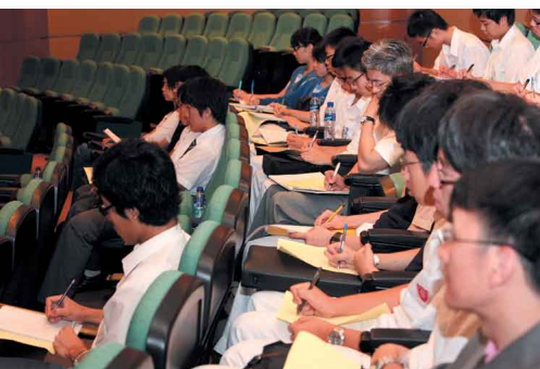
Students are giving their full attention to the briefing by experts from the Commissioner's Office on the Training Day

Note: In view of the wide spread of H1N1 virus in the community and taking into consideration the health management issue, the Final was cancelled and the 5 teams were all named winning teams with no distinction, and the study tour to the Pearl River Delta region has been replaced by book coupons.