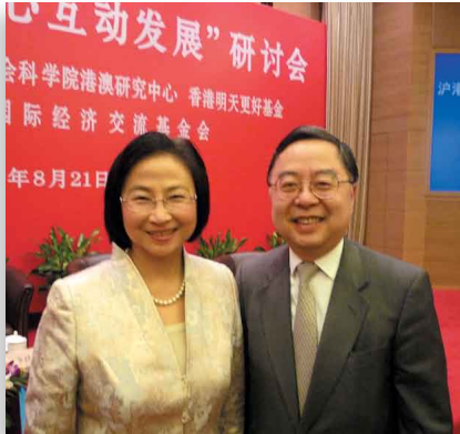
Forum on "Hong Kong and Shanghai: Collaborative Development of International Trade Center and the Internationalization of Renminbi"