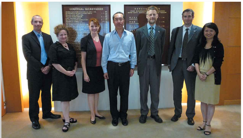
Meeting with Mr. Henry Tang, Chief Secretary for Administration (middle)

The beauty of the nature in Inner Mongolia has earned international acclaim, which was echoed by the delegation. They visited the Old Cow Crescent, a former strategic military place in ancient times. It is also the place where the Great Wall reached the Yellow River. The group did not miss the chance to visit the famous