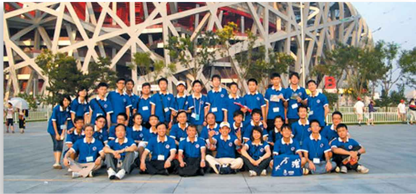
Visit the Bird's Nest during the study tour to Beijing and Tianjin