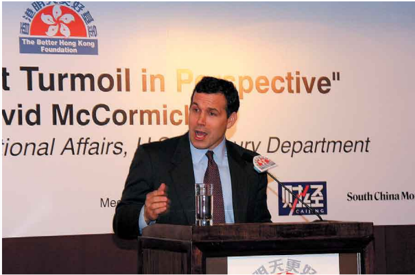
Mr. David McCormick sharing with the audiences his views on the recent global financial turmoil and the way forward