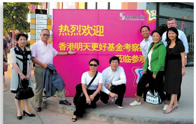
Visit the Startoon City

A detailed itinerary is available on the Foundation's website www.betterhongkong.org .