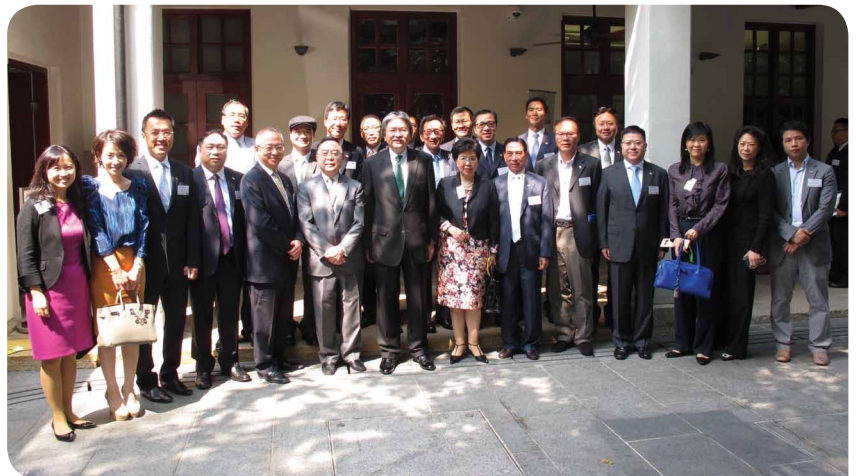
With Mr. John Tsang and Dr. Margaret Chan