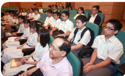
Shortlisted teams attending the training provided by experts at the Commissioner's Office