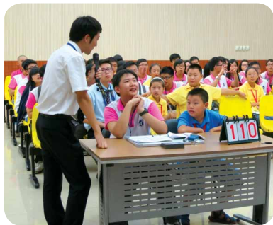
Interacting with little helpers of the Inner Mongolia Museum