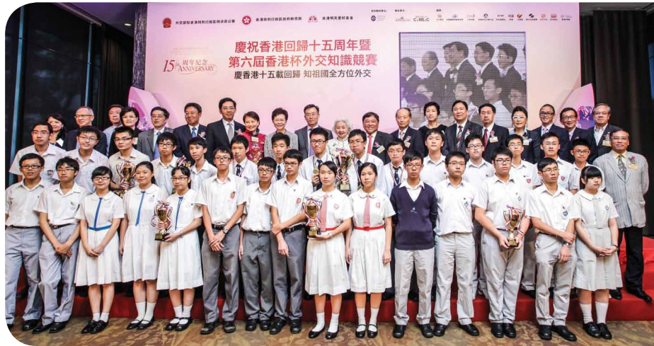
The Final was successfully held on 7 July

Since the launch of the contest in 2007, more than 170,000 students from primary and secondary schools have participated in the contest. This year, we have received enrollments from more than 100 school teams and over 3,000 students. For the open competition for the general public, around 20,000 people participated in this category, breaking our past records. To attract more participation from students, two competitions on T-Shirt and Logo designs were held respectively alongside the main contest.