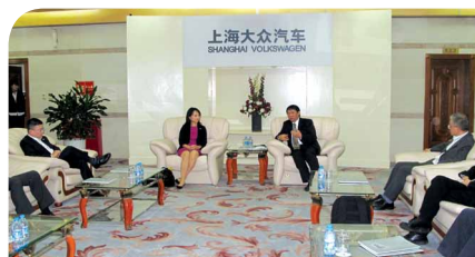
Visit to Shanghai Volkswagen Automotive Co Ltd

of international chambers of commerce and organisations, business leaders of multinational companies and foreign media correspondents in Hong Kong. The Foundation was the supporting organization of the forum.