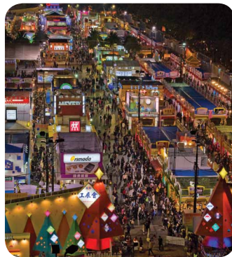
Gold award of the 46th Hong Kong Brands & Products Expo Photography Competition