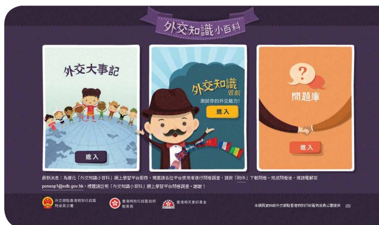
Website of the On-Line Learning Platform on Diplomatic Knowledge

Website: http://diplomatic.edb.hkedcity.net/