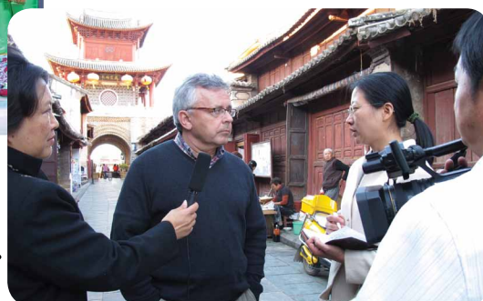
Interview by a local television station