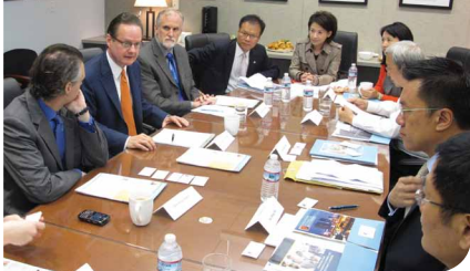
Visit to the George Washington University