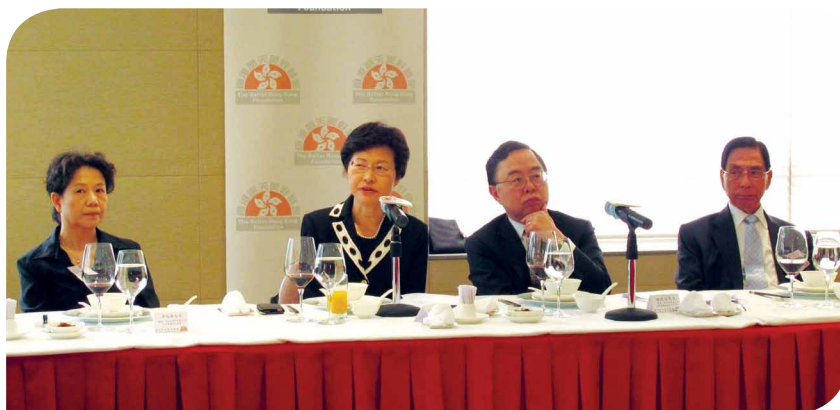
The Chief Secretary for Administration Mrs. Carrie Lam (2nd left)