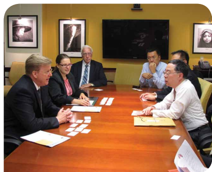
Visit to the U.S. Department of States