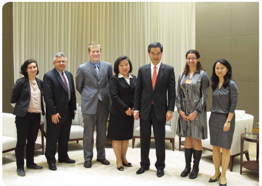
Meeting with the Chief Executive Mr. Leung Chun-ying (3rd right)

In an effort to enhance the understanding of China and Hong Kong by American media, since 1996 the Foundation has invited between six to eight American journalists each year to visit China and Hong Kong. The Foundation sponsored and organized their trip. With the support of the Ministry of Foreign Affairs of the PRC, the program enables the journalists to meet with senior central government officials in Beijing and local municipal officials in one of the second or third tier cities in China. The Foundation also organizes meetings with key industry and business players, academic and research institutions and media people to broaden the participants' network other than providing them an overview of the cities they visited. This year, the Foundation, in association with the All-China Journalists Association (ACJA) and the East-West Center organized the third