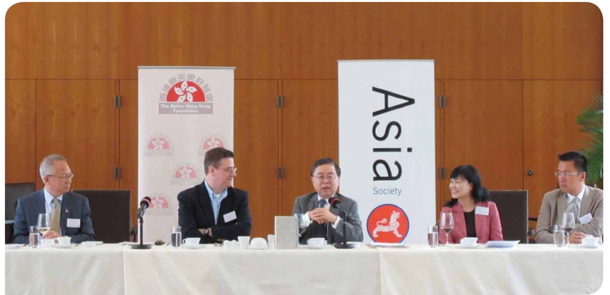
Hosting a luncheon for the U.S. Congressional Staffers Delegation