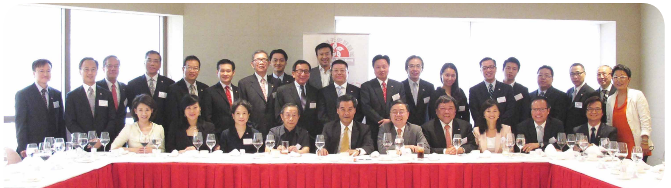
With the Chief Executive Mr. Leung Chun-ying