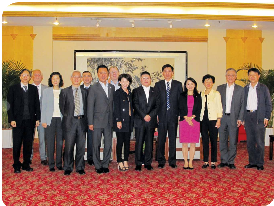
Visit to Baosteel Group Corporation