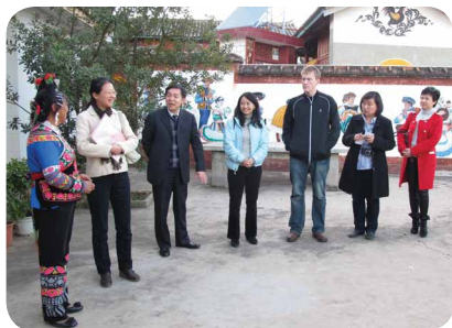
Visit to Zixi Yi Village