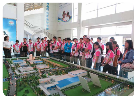
Visit the Inner Mongolia Yili Industrial Group Co Ltd