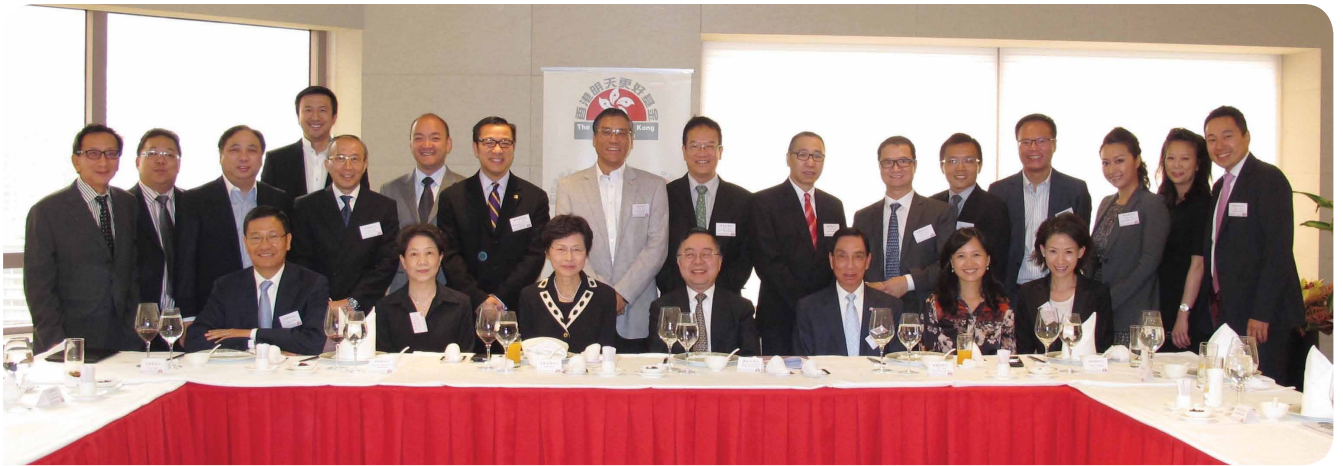
With Mrs. Carrie Lam (front row, 3rd left)