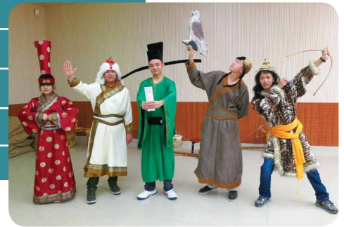
Role playing as people in Song and Yuan Dynasty at the Inner Mongolia Museum