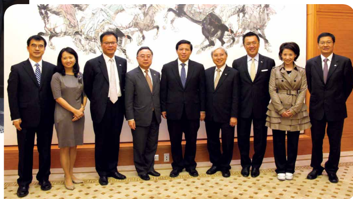
The Better Hong Kong Foundation Delegation to the United States 2012