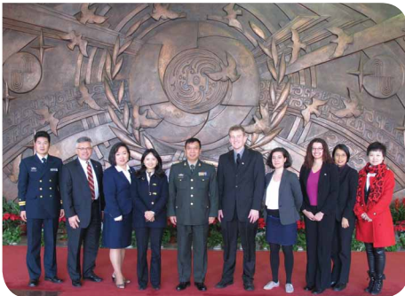
Visit to Ministry of National Defense

authorities and communities in different areas and seeing the developments for themselves, the U.S. journalists gain a better understanding of the current situation and future development of Hong Kong and Mainland China.