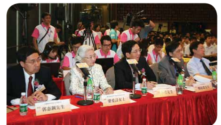
Invited by the Foundation, Ms. Elsie Leung (2nd left), former Secretary for Justice, was one of the judges of the Final