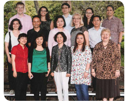
Journalists from the U.S. and China met at the East-West Center to report on their experiences during the trip