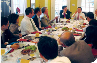
Breakfast meeting with key congressional advisors at the headquarter of U.S.-Asia Institute