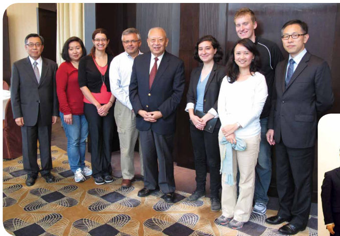
The 2012 China-U.S. Journalists Exchange