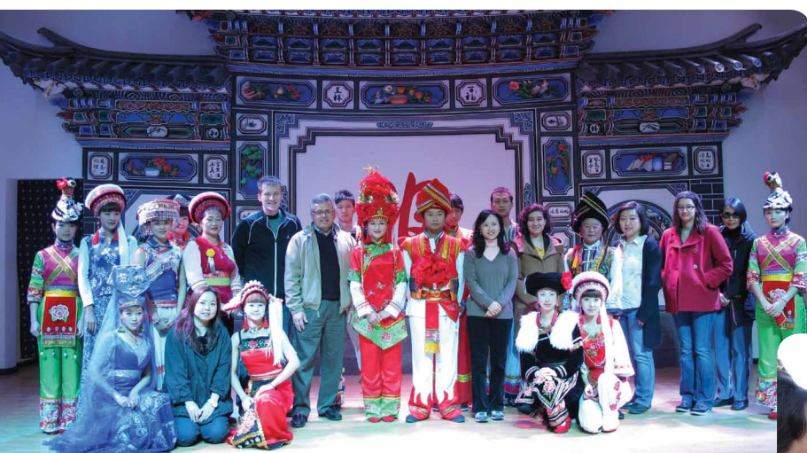
Enjoy a variety show by Bai people