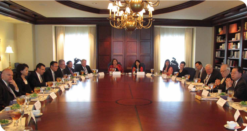
Luncheon presentation hosted by the Heritage Foundation