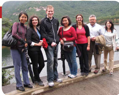
A leisure walk at Tai Tam Reservoir