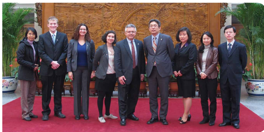
Visit to Ministry of Foreign Affairs