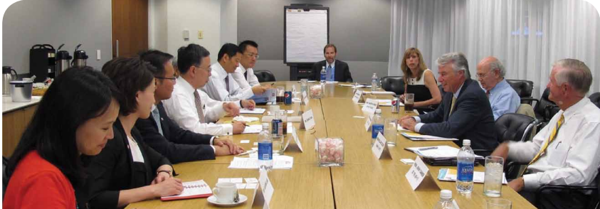
Meeting with former Members of Congress