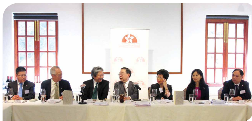
The Financial Secretary Mr. John Tsang (3rd left) and Director-General of World Health Organization Dr. Margaret Chan (3rd right)