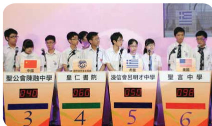
Students have great performance at the Final