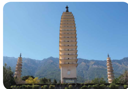
Visit Three Pagodas of Chongshen Temple (Buddhism)