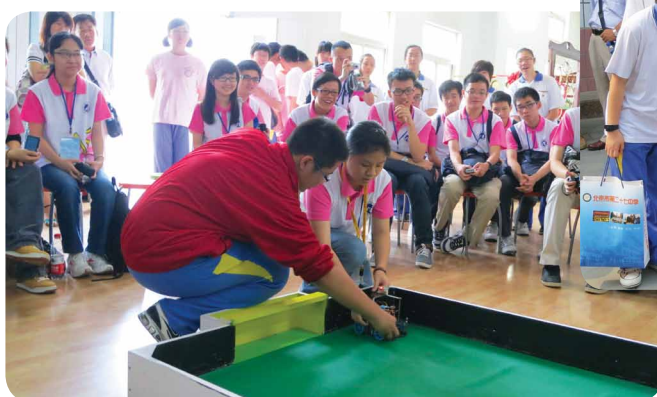
Exchange with secondary school students in Beijing