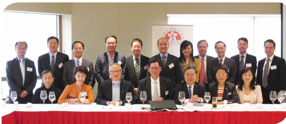
The Chief Executive of Hong Kong Monetary Authority Mr. Norman Chan (front row, middle)