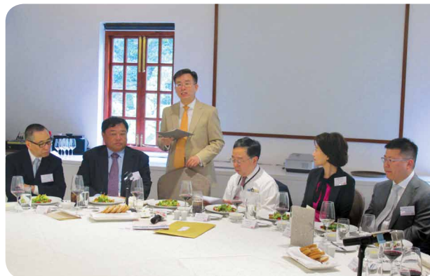
With the Commissioner of Ministry of Foreign Affairs in the HKSAR Mr. Song Zhe