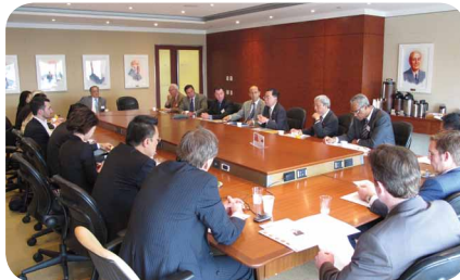
Exchange with the Foreign Policy Association