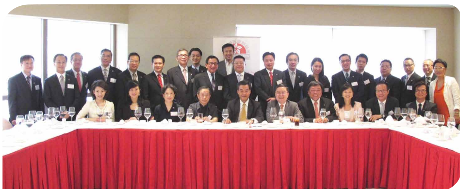
The Chief Executive Mr. Leung Chun-ying (front row, 5th left)