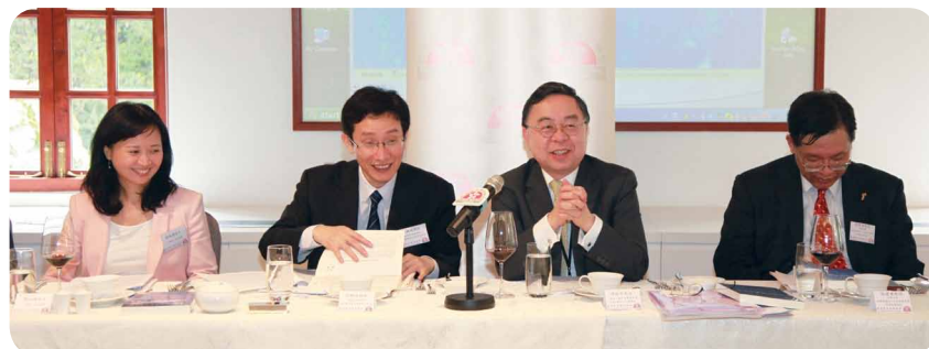
The Foundation's Executive Committee Chairman Mr. Ronnie Chan (2nd right) chaired the luncheon discussion session