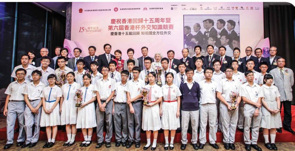
The 6th Hong Kong Cup Diplomatic Knowledge Contest

Executive Director The Better Hong Kong Foundation