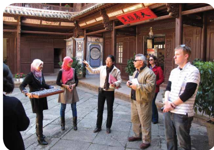
Visit to Dong Lianhua Village (Muslim village)