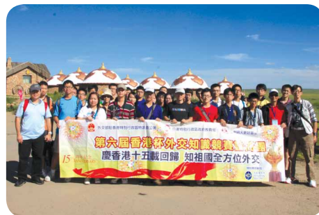
Beautiful grassland in Inner Mongolia