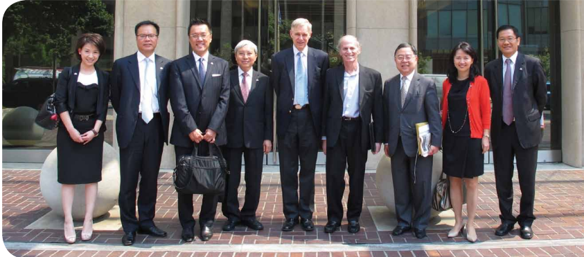
Visit to the Brookings Institution