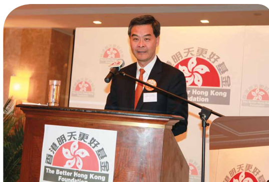
Mr. Leung Chun-ying sharing his manifesto with guests