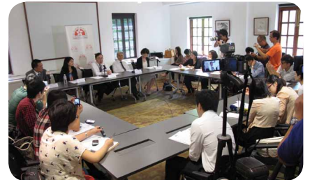
A post-trip conference was held on 11 July 2012 in Hong Kong