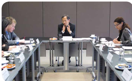
Meeting with Mr. Jasper Tsang, President of Legislative Council