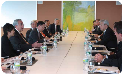
Luncheon presentation organized by the Hong Kong Association of New York