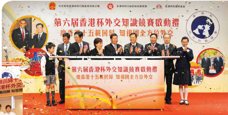
Kick-off ceremony on 18 February