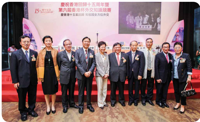
Chief Secretary for Administration Mrs. Carrie Lam (5th left) was the guest-of-honor of the Final