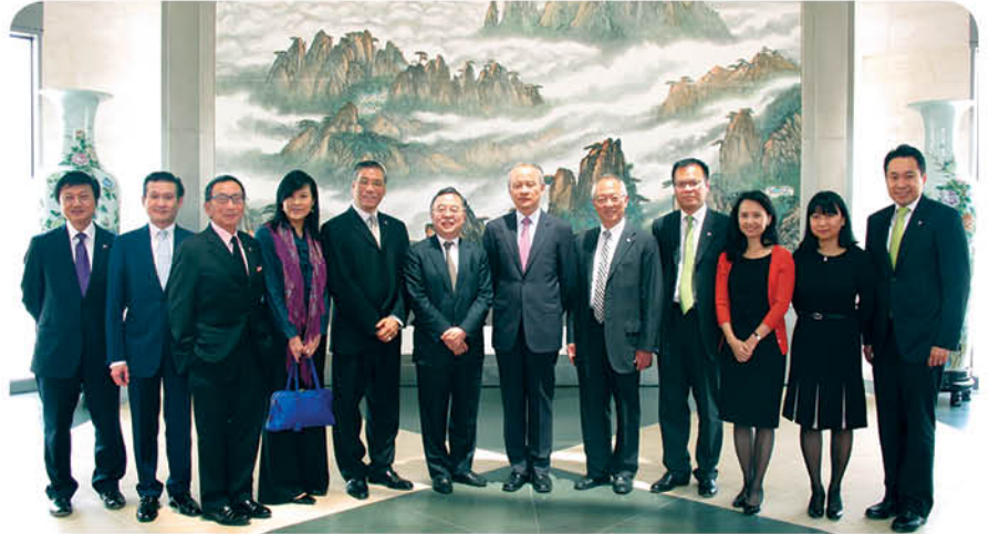
Ambassador Cui Tiankai (6th right) hosted a luncheon at the Embassy of the People's Republic of China in the U.S.A.