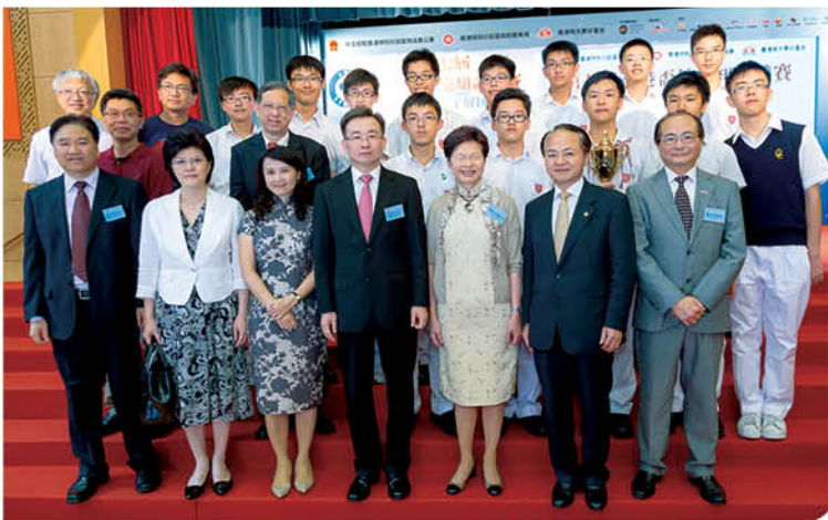
The 7th Hong Kong Cup Diplomatic Knowledge Contest