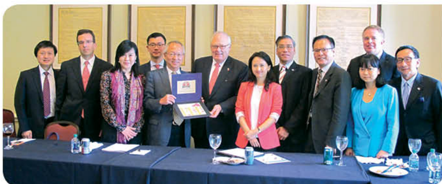
Luncheon hosted by the Heritage Foundation and chaired by its Founder Dr. Edwin Feulner