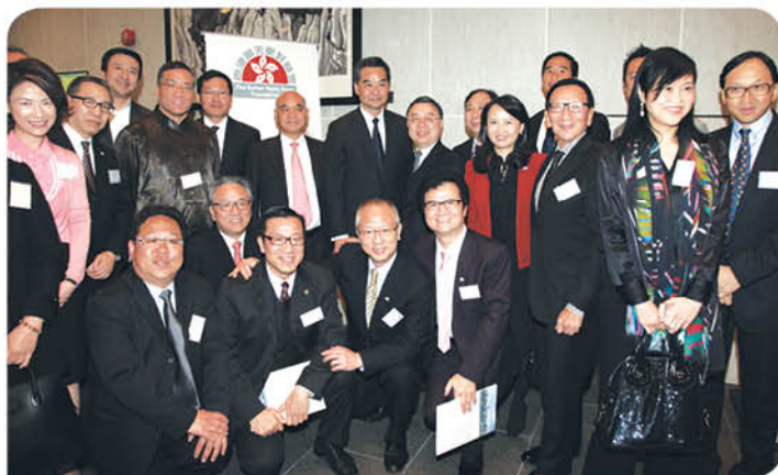
The Foundation's members and the Chief Executive Mr. Leung Chun-ying