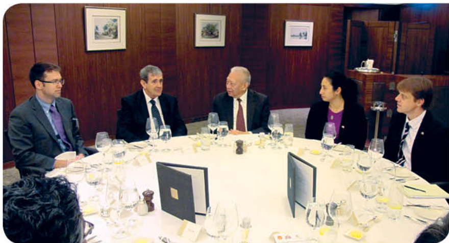
The 2013 China-U.S. Journalists Exchange