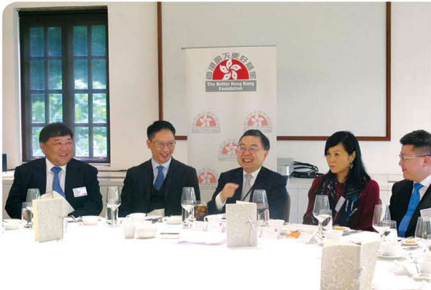
Members enjoying the discussion with Mr. Rimsky Yuen (2nd left)