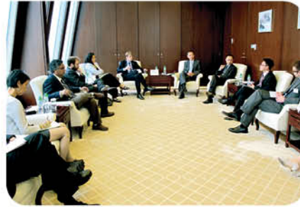
Visit to the Hong Kong Monetary Authority