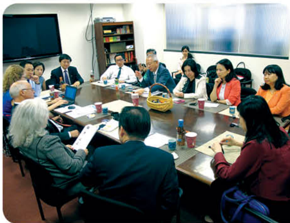
The Better Hong Kong Foundation Delegation to the United States 2013