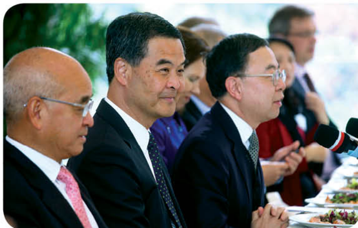
The Better Hong Kong Foundation Spring Luncheon for Consuls General & Chairmen of International Chambers of Commerce in Hong Kong

It has always been the mission of the Better Hong Kong Foundation ("Foundation") to encourage ideas exchange and to promote understanding and collaboration between Hong Kong, Mainland China and counterparts around the world. In June, the Foundation sent again its annual delegation to the U.S. which was co-led by Executive