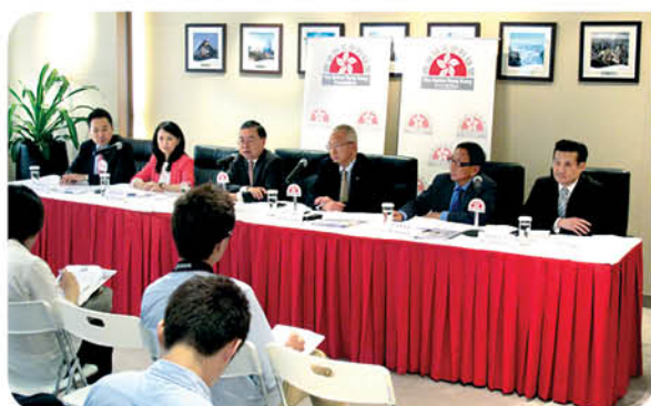
A post-trip press conference was held on 26 June 2013