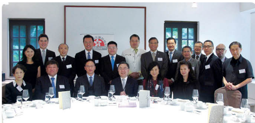
With the Secretary for Justice Mr. Rimsky Yuen

This year, Hong Kong has been consecutively ranked as the most competitive city in the China Urban Competitiveness Report by the Chinese Academy of Social Science since 2007. Hong Kong has its unique competitive advantages, especially in playing the role of the "super connector" providing the necessary funding, talent and internationally recognized business system for the world and China. In May, the Secretary for Justice, Mr. Rimsky Yuen, spoke at the Foundation's luncheon. He shared his thought on the great potential of Hong Kong as a regional arbitration