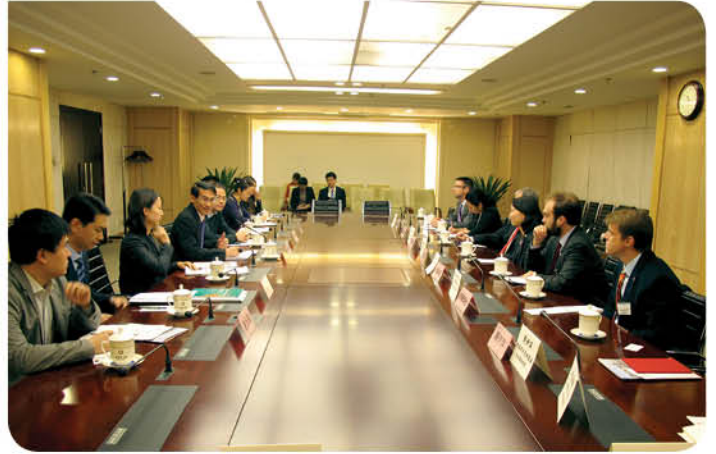
The 2013 China-U.S. Journalists Exchange

and dispute resolution center in Asia. However, we shall not be complacent with where we are now but shall proactively seize opportunities and contribute our share in China's prospects and prosperity.