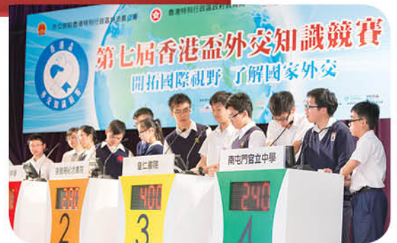
On 18 May 2013, 16 shortlisted teams competing in the Semi-Final