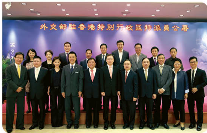
With Commissioner of the Ministry of Foreign Affairs in the HKSAR Mr. Song Zhe

In October, under the 4th China-U.S. Journalists Exchange program, the Foundation hosted seven U.S. journalists visiting Beijing, Nanchang and Hong Kong. The trip allowed them to experience developments in Hong Kong and in Mainland China. By visiting places and interacting with people, we hope that the journalists were able to explore Hong Kong and Mainland China with different perspectives.