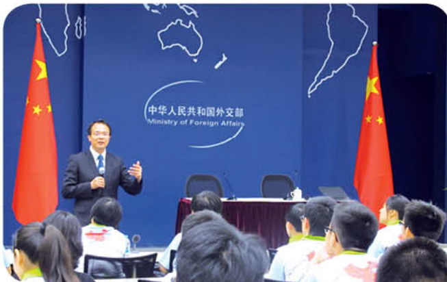
Mr. Hong Lei, Spokesman of the Ministry of Foreign Affairs sharing his experience with students at the Blue Hall, the Ministry's press conference hall