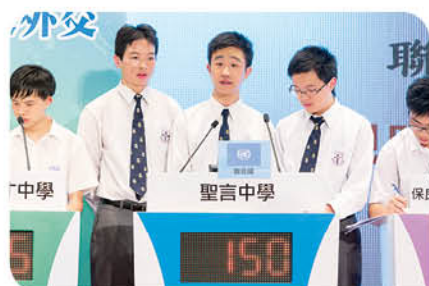
Sing Yin Secondary School won the championship for two consecutive years