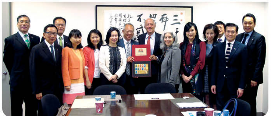
Exchange with the National Committee on U.S.-China Relations