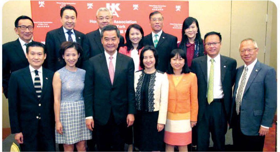
With the Chief Executive Mr. Leung Chun-ying (front row, 3rd left) at the Hong Kong Association of New York breakfast meeting

During the visit to New York, the delegation participated in the "Think Asia Think Hong Kong" conference organized by the Hong Kong Trade Development Council as well as its Hong Kong Dinner. The delegation was also invited to join the reception hosted by the HKETO New York in honor of the Chief Executive Mr. Leung Chun-ying in celebration of its 30th anniversary of establishing its office in New York. After visiting Washington D.C., seven delegates went on to participate in the "Think Asia Think Hong Kong" conference in Los Angeles. They were also invited to the luncheon hosted by the HKETO San Francisco and the opening ceremony and launch reception for "Hong Kong Live" hosted by the Hong Kong Tourism Board respectively.