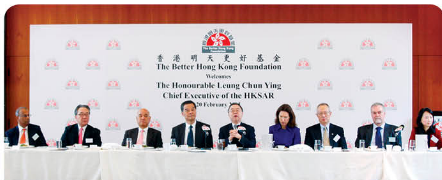
The Foundation is honored to have invited the Chief Executive of HKSAR Mr. Leung Chun-ying (4th left) to speak at the luncheon