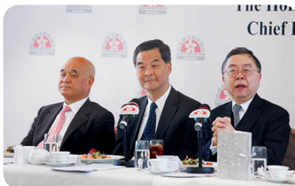
On behalf of the Foundation, Executive Committee Chairman Mr. Ronnie Chan (right) together with Advisory Council Chairman Dr. Henry Cheng (left) giving our warmest welcome to the Chief Executive Mr. Leung Chun-ying