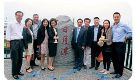
Tour around Sun Moon Lake