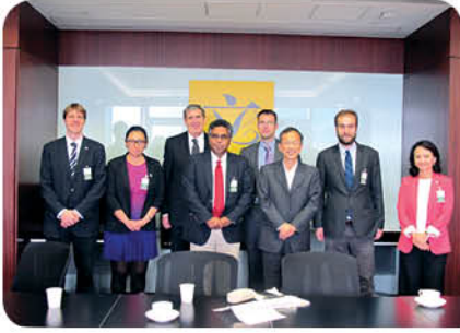
Meeting with Mr. Jasper Tsang (3rd right), President of the Legislative Council