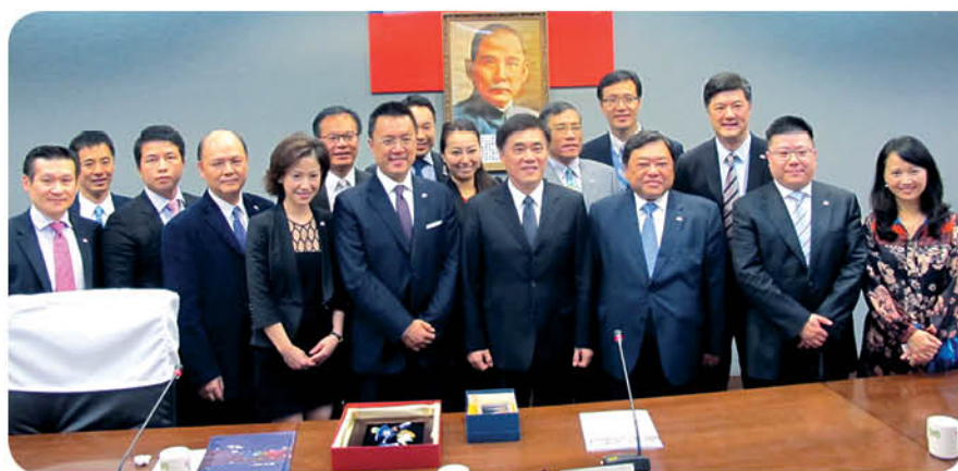
Meeting with Mayor of Taipei City Mr. Hau Lung-bin (front row, 4th right)