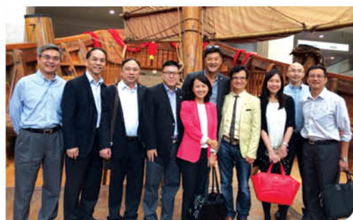
Visit to Shanghai Maritime Museum