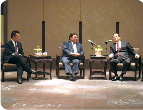
The Better Hong Kong Foundation Delegation to Taiwan