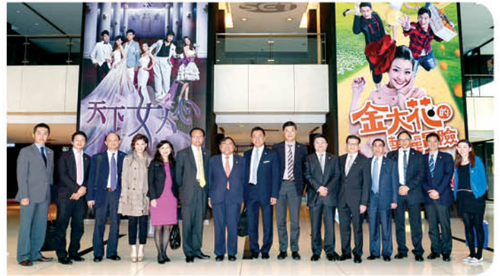
Visit to Sanlih E-Television