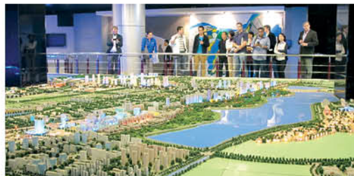
Visit to Nanchang High-tech Industrial Development Zone