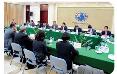
Meeting with experts from the China Institute of International Studies