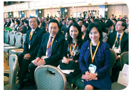
At the HKTDC's Think Asia Think Hong Kong conference in New York