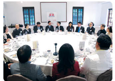
With Mr. Rimsky Yuen

Founder of HKGolden50 and Non-official Member of Executive Council