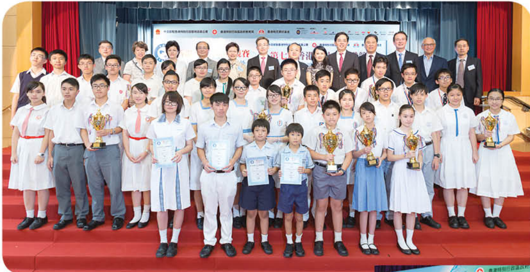
The Final was successfully held on 6 July

On 9–16 August 2013, a study tour to Beijing and Harbin was organized for the winning teams. Through the contest, we hope that young people and the general public in Hong Kong will become more interested in learning about the development of China in the context of world diplomacy.