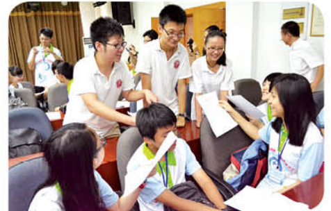
Students from Harbin No 3 High School teaching Hong Kong students how to speak in Dongbei dialect