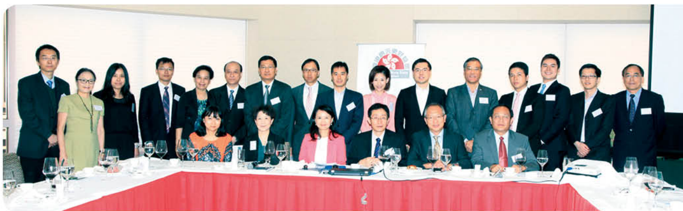
A discussion luncheon on the report amongst the Foundation's members and invited guests was held before the press conference

carefully so as to map out long-term strategies and short-term measures to cope with global changes as well as to seize every opportunity.