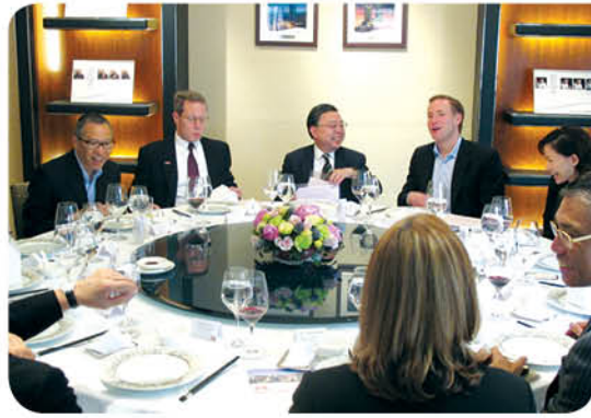
With U.S. Congressional Staffers Delegation