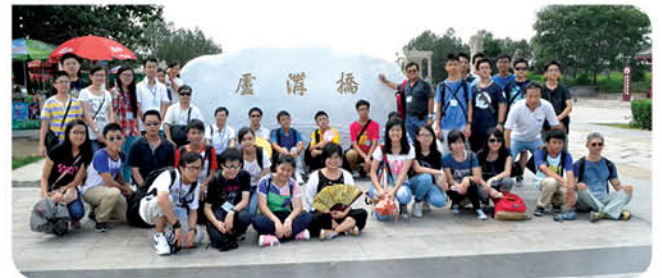
Visit to Lugou Bridge