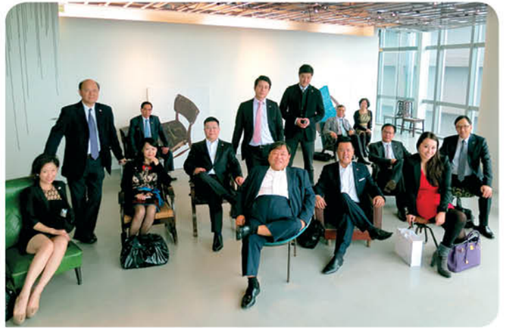
Photo taken at Xue Xue Institute

In order to gain a better understanding of economic and cultural developments in Taiwan as well as its investment environment and opportunities, the Foundation organized its first delegation to Taiwan from 16 – 19 April 2013, visiting the cities of Taipei and Taichung. During the trip, the delegation had fruitful meetings with the mayors of the two cities; Honorary Chairman of the Kuomintang Mr. Lien Chan; representatives from commercial, industrial and cultural industries; and experts from local think tanks. It is hoped that further deliberation and collaboration will be enhanced after the visit. The delegation was supported by Hong Kong Economic, Trade and Cultural Office in Taiwan and the Taipei Economic and Cultural Office in Hong Kong.