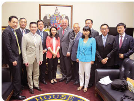
With Congressman Jo Bonner