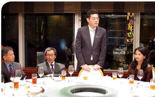
With Mr. Qin Gang