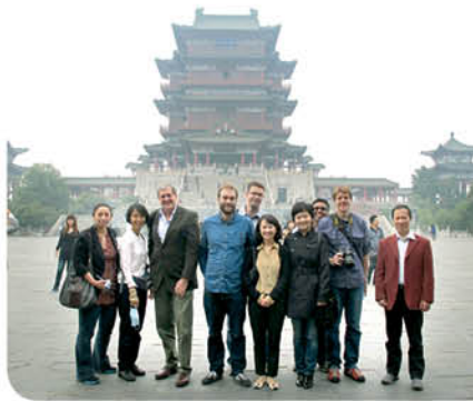
Visit to Teng Wang Pavilion in Nanchang