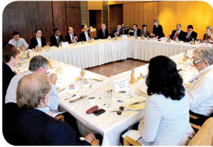
Breakfast meeting hosted by the Vision 2047 Foundation