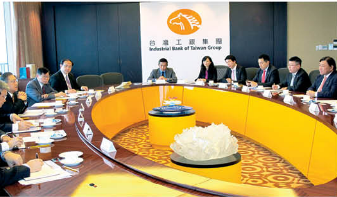
Meeting with the Chinese National Association of Industry & Commerce, Taiwan