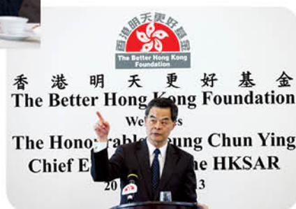
The Chief Executive Mr. Leung Chun-ying sharing his vision of Hong Kong as a competitive hub serving the Mainland market