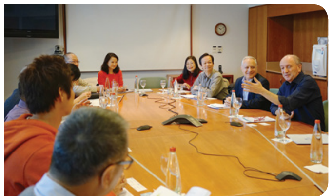
Meeting at Weizmann Institute of Science