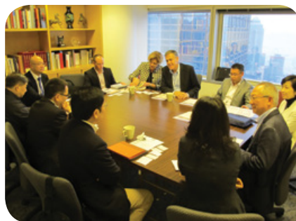
Meeting with representatives from JVP Media Quarter, Israel

Founding Director of the Institute of Global Economics and Finance, The Chinese University of Hong Kong