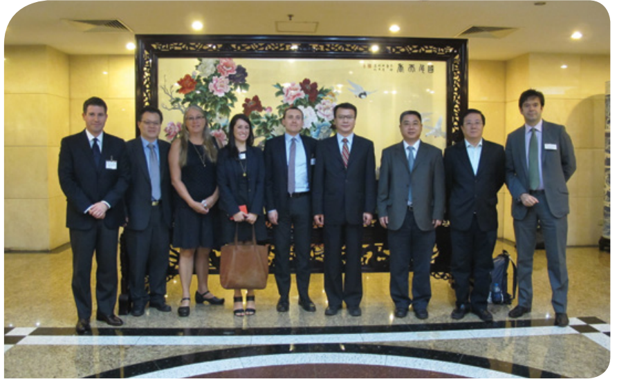
Meeting with National Development and Reform Commission

In an effort to enhance the understanding of China and Hong Kong by the American media, since 1996 the Foundation has invited six to eight American journalists each year to visit China and Hong Kong. The Foundation sponsored and organized their trip. With the support of the Ministry of Foreign Affairs of the PRC, the program enables the journalists to meet with senior central government officials in Beijing and local municipal officials in one of the second or third tier cities in China. The Foundation also organizes meetings with key industry and business players, academic and research institutions and media figures to broaden the participants' network other than providing them an overview of the cities they have visited. This year, the Foundation, in association with the All-China Journalists Association (ACJA) and the East-West Center, organized the Fifth China-U.S. Journalists Exchange program, as an expansion of the original Hong Kong Journalism Fellows program by adding the visit of the Chinese journalists to the U.S. The theme of this year's program is "Bridging the Gaps in Understanding between China and the United States".