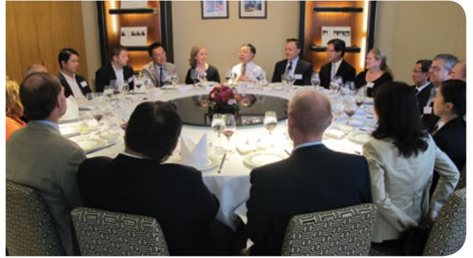
The Foundation hosts a luncheon for the Delegation of U.S. Congressional Staffers