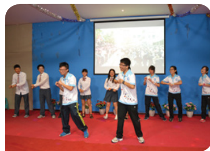
Visit to Bonan Senior Middle School