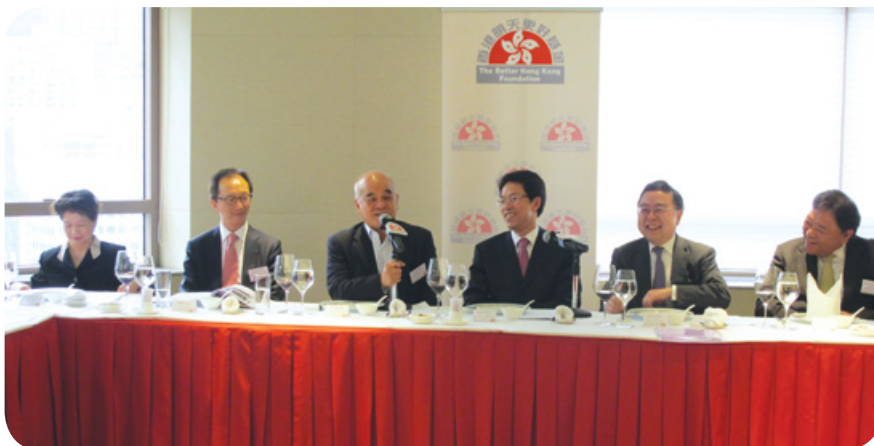
Meeting with Mr. Zhang Xiaoming, Director of the Liaison Office of the Central People’s Government in the HKSAR

Media is an important medium in cultivating understanding between people and society. This year, the Foundation continues organizing the 5th China-U.S. Journalists Exchange, jointly with the All-China Journalists Association and the East-West Center. The program brought a group of five U.S. journalists to Beijing, Ningxia and Hong Kong; and five Mainland China