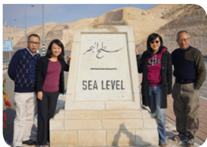
Entering Dead Sea