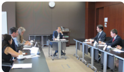
Meeting with Mr. Jasper Tsang, President of the Legislative Council