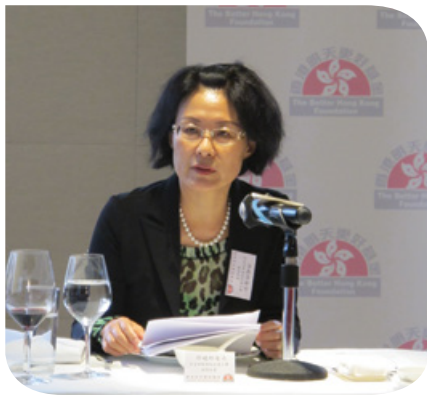
Deputy Commissioner Tong Xiaoling briefing guests on the current international environment