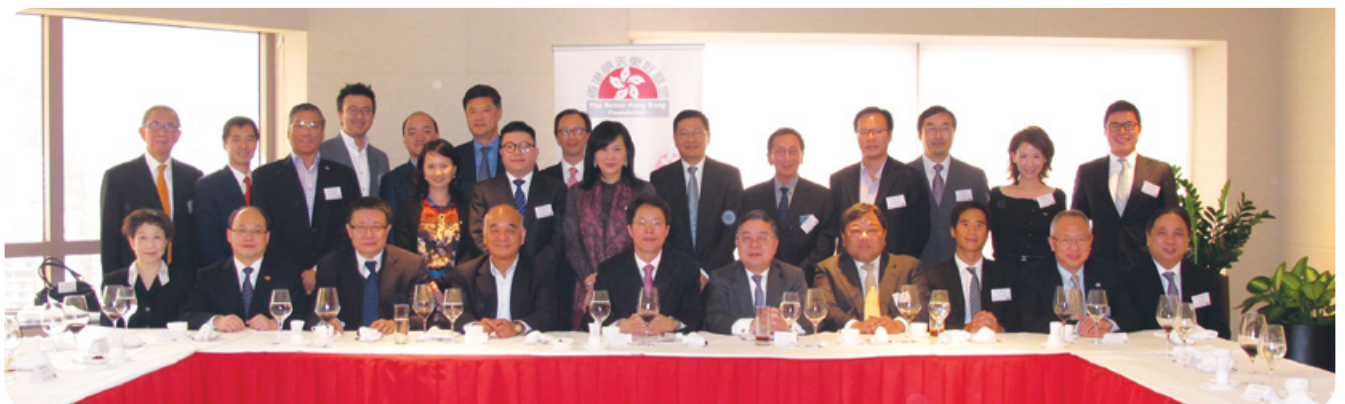
Meeting with Mr. Zhang Xiaoming (5th left), Director of the Liaison Office of the Central People's Government in the HKSAR