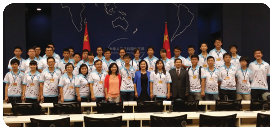
Ms. Hua Chunying, Spokesperson and Deputy Director-General of the Information Department (front row, 8th right) exchanging with the group at the Blue Hall, the Ministry's press conference hall