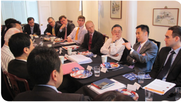
Delegation to the United States