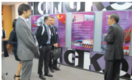
Visit to the HKSAR Government Office in Beijing