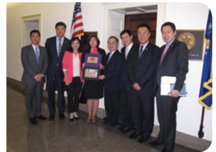
With Congresswoman Grace Meng (4th left)