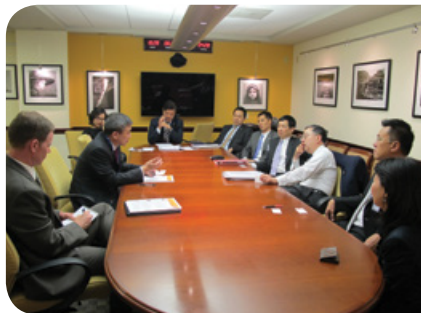
At the U.S. Department of State