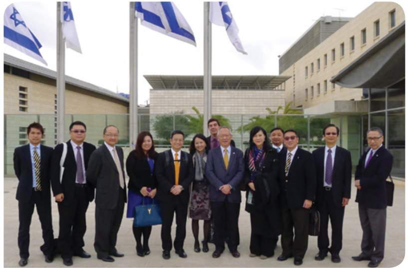
Visit to the Ministry of Foreign Affairs