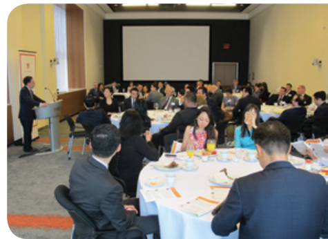
Breakfast Meeting hosted by Hong Kong Association of New York