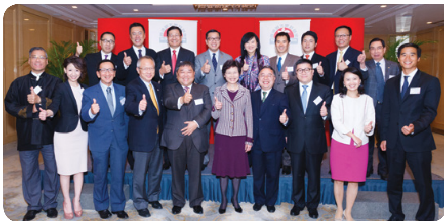
The Foundation's members together with Mrs. Carrie Lam (front row, 5th right) wishing the success of the constitutional development in Hong Kong