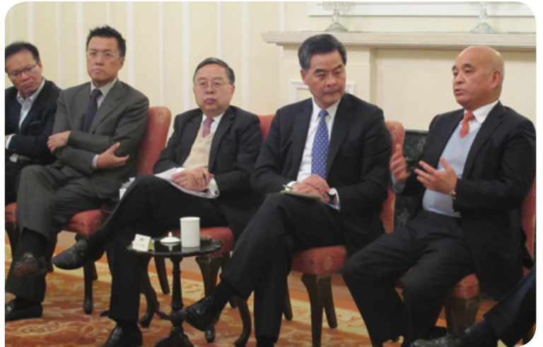
Meeting with the Chief Executive Mr. Leung Chun-ying