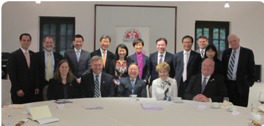
The Foundation hosts a luncheon for U.S. Congressman Jim Matheson (front row, 2nd left), Congresswoman Madeleine Bordallo (front row, 2nd right) and Congressman Billy Long (front row, 1st right) during their visit to Hong Kong