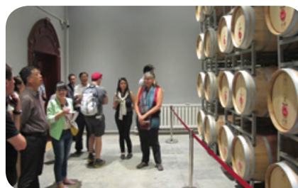
Ningxia Yuquanying Wine Base