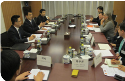
Meeting with Department of North America and Oceania, Ministry of Foreign Affairs

how media coverage of each country can be improved. Through direct dialogue with local authorities and communities in different areas and seeing the developments for themselves, the U.S. journalists gain a better understanding of the current situation and future development of Hong Kong and Mainland China.