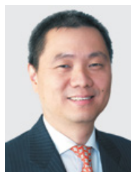
Haitong International Securities Group Ltd