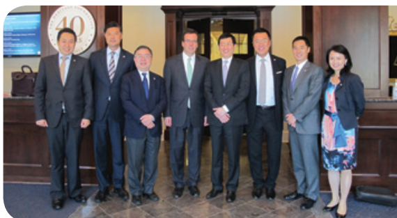
Exchange with the Heritage Foundation