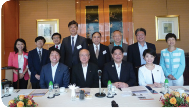
Meeting with the Delegation of Japan-Hong Kong Parliamentarians League