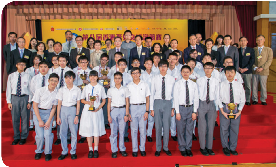
The Final was successfully held on 5 July 2014

Over 4,000 students from primary and secondary schools participated in this year's contest. After first-round and semi-final competitions, six shortlisted teams entered into the Final and competed for the championship on 5 July 2014.