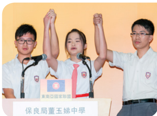
Po Leung Kuk Tung Yuk Tien College won the Gold Award

Their knowledge of foreign diplomatic affairs of the PRC, Hong Kong-related foreign affairs, national and international affairs, international relationships and diplomatic etiquette, was challenged at the contest. Competition was fierce and the championship went to Po Leung Kuk Tung Yuk Tien College. Some 300 were in attendance, including students and teachers from primary and secondary schools for the Final and were amazed by the excellent performances of the finalists. Besides the main contest, a T-Shirt design competition was also organized to encourage more participation from students.