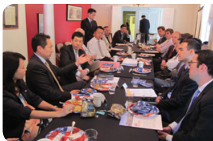
Capitol Hill Luncheon Meeting hosted by the U.S.-Asia Institute