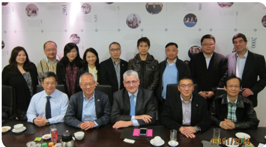
Visit to Israel Diamond Institute