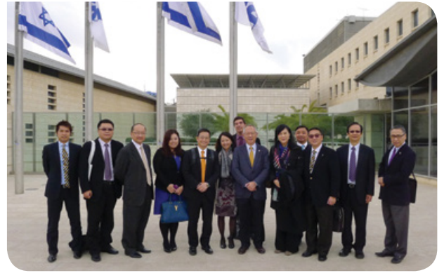
Delegation to Israel

journalists to Philadelphia, Pennsylvania and Washington D.C. in the U.S.; and for these two groups of journalists to exchange their views after visiting each other's countries. During the journey, American journalists could appreciate the diversity of China, a different culture and developments in China from a new perspective.