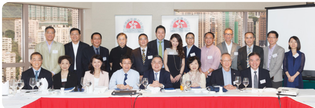
The Foundation's members and invited guests exchanging views at the discussion luncheon