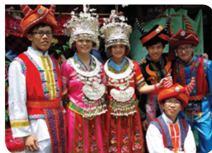
Students dress in Miao style