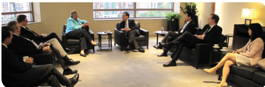
Meeting with the Delegation of All Party Parliamentary China Group, U.K.