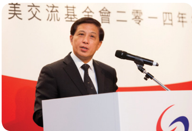
Vice Foreign Minister Zhang Yesui delivering a keynote speech at the VIP dinner

an opening keynote at the conference. Participants were able to learn more about the 2015 economic outlook for both China and the U.S. After the conference, a VIP dinner was held where Vice Foreign Minister Zhang Yesui delivered a keynote speech.