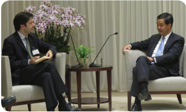
Meeting with the Chief Executive Mr. Leung Chun-ying (right)