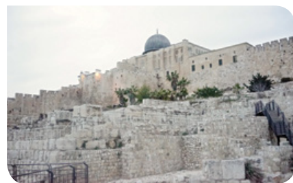
Mount of Olives