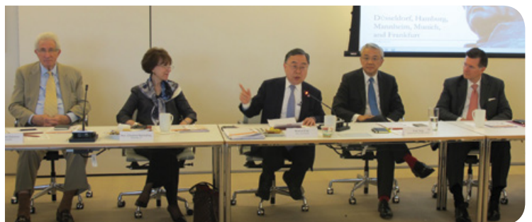
Breakfast Meeting hosted by the America China Public Affairs Institute