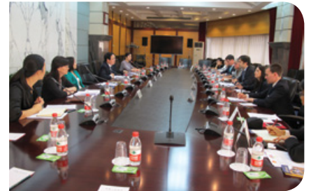
At the People's Bank of China