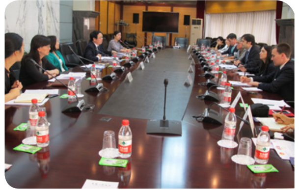
The China-U.S. Journalists Exchange

to explain the plan and how this innovative approach is to link up the stock markets between Hong Kong and Shanghai, and further help the opening up of China's stock market to the world as well as the internationalization of the RMB.