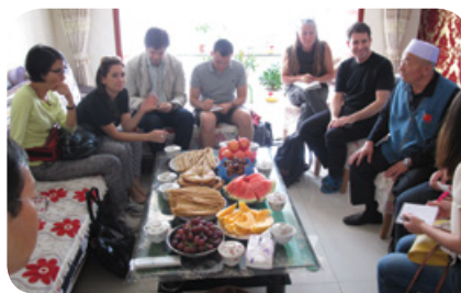
Visit the local residents in Najiahu Village