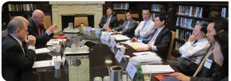
Meeting at the Brookings Institution