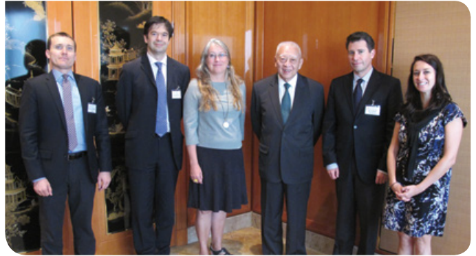
Mr. Tung Chee-hwa (3rd right), Vice Chairman of Chinese People's Political Consultative Conference and first Chief Executive of the HKSAR hosts a breakfast meeting for the delegation