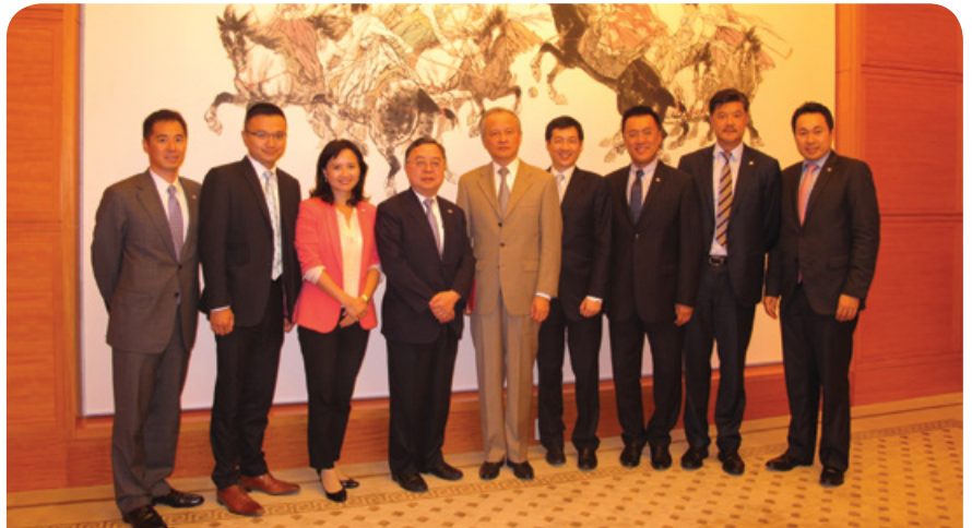
Ambassador Cui Tiankai (middle) hosts a luncheon at the Embassy of People's Republic of China in the U.S.A.