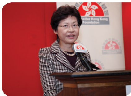
Mrs. Carrie Lam introducing the methods for selecting the Chief Executive in 2017 and for forming the Legislative Council in 2016