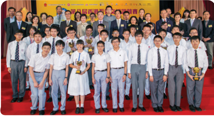
The 8th Hong Kong Cup Diplomatic Knowledge Contest