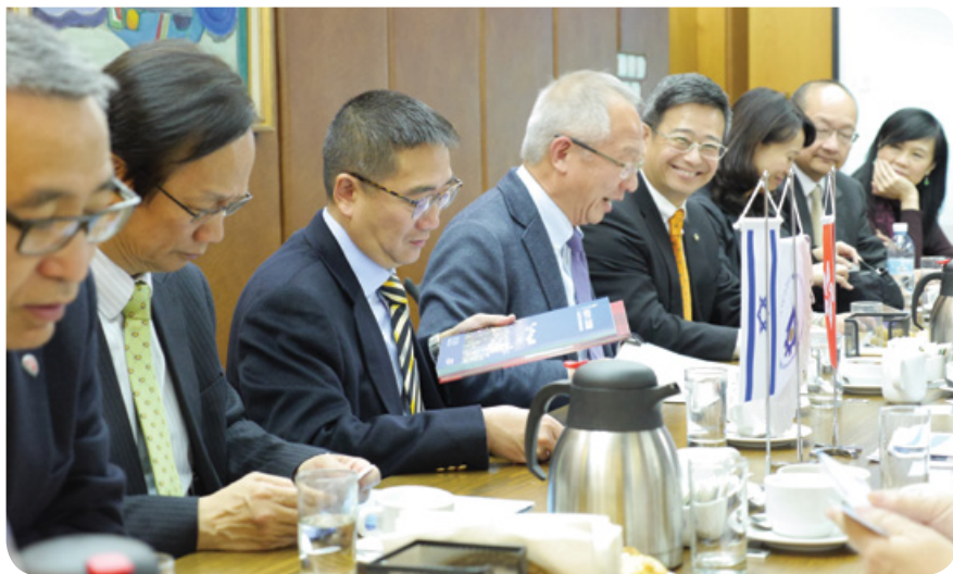
Meeting at Manufacturers' Association of Israel