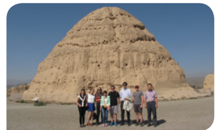
Western Xia Imperial Tombs