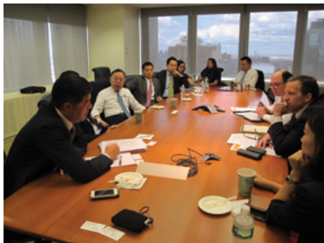
At Standard & Poor's