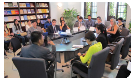
Exchange with Associate Dean and students of the School of Journalism and Communication, Tsinghua University