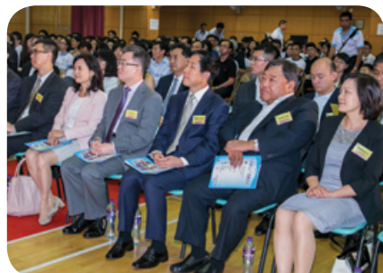
Nearly 300 audiences attending the Final to enjoy the excellent performance of students