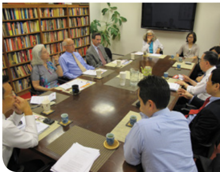
Exchange with the National Committee on U.S.-China Relations