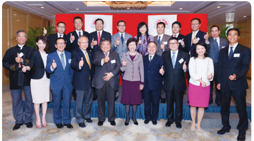
Spring Luncheon for Consuls General & Chairmen of International Chambers of Commerce in Hong Kong