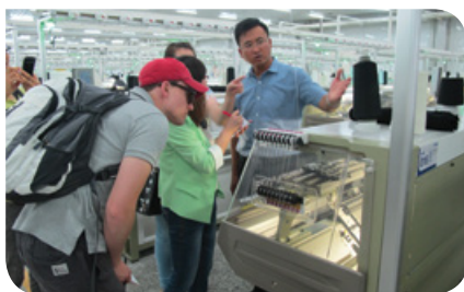
Lingwu Cashmere Industry Park