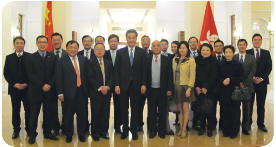
Meeting with the Chief Executive Mr. Leung Chun-ying

The launch of “Shanghai-Hong Kong Stock Connect” in November concludes 2014 with some excitement on the economic front. It is a very important milestone for Hong Kong. It does not just further strengthen Hong Kong’s position as an international financial center and its role as “super-connector”, linking Mainland China and the world but will also help further speed up the internationalization of the RMB. On constitutional development, Hong Kong as a special administrative region of China, is granted the right to elect its own Chief Executive in 2017 by one man one vote if the public could agree on the election method and our Legislative Council could pass the proposal by a majority. Hong Kong is an open society and, diverse views are expected. We hope that society could learn from this exercise and progress as a more mature civil society so that we could respect each other and embrace diversity. Our common goal is to make Hong Kong a better place to live and to prosper. Rule of law, stability and openness of society are the cornerstones of Hong Kong’s success, which we need to continue to dearly uphold. Through communication, mutual