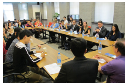
Exchange with lecturers and students of School of Journalism and Communication, Tsinghua University