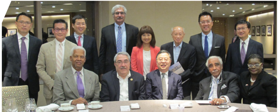
Meeting with U.S. Congressional Black Caucus Delegation

This year, the annual Shanghai conference that the Foundation organized together with the Shanghai Academy of Social