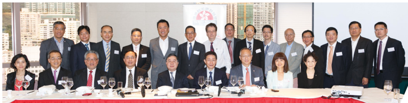
The Foundation's members and invited guests exchange views at the discussion luncheon