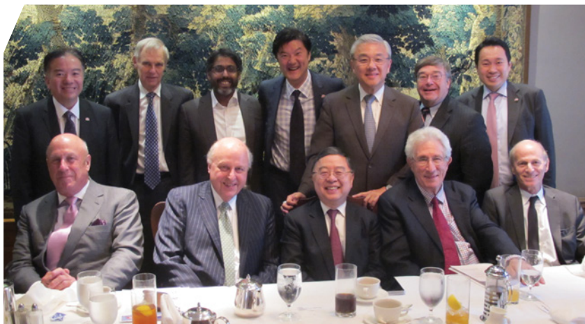
The Foundation's Delegation to the United States