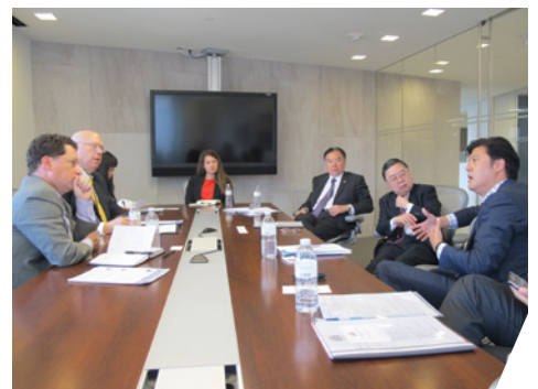
Meeting at Center for Strategic and International Studies