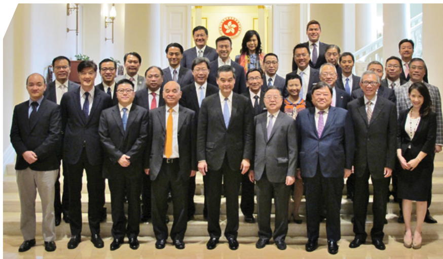
Luncheon hosted by the Chief Executive Mr. Leung Chun-ying at the Government House

The world economy is recovering though not with flying colors. China, in the midst of the "New Normal", is still the center of the world's attention. It is the second largest economy in the world. The launch of the new Silk Road plan dubbed as "One Belt, One Road", the introduction of the Asian Infrastructure Investment Bank (AIIB), the inclusion of the RMB in the basket of the IMF's Special Drawing Rights (SDR) for example put China in a more important and hopeful position in the world. What is important is that all these initiatives are of the intention that "all parties win".