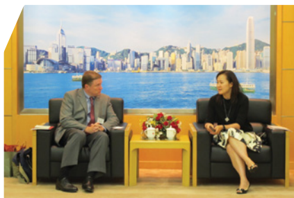
Visit to the HKSAR Government Office in Beijing