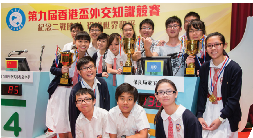
The 9th Hong Kong Cup Diplomatic Knowledge Contest

Executive Director The Better Hong Kong Foundation