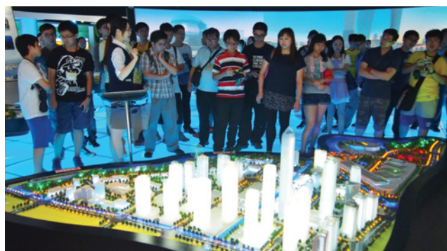
Suzhou Industrial Park