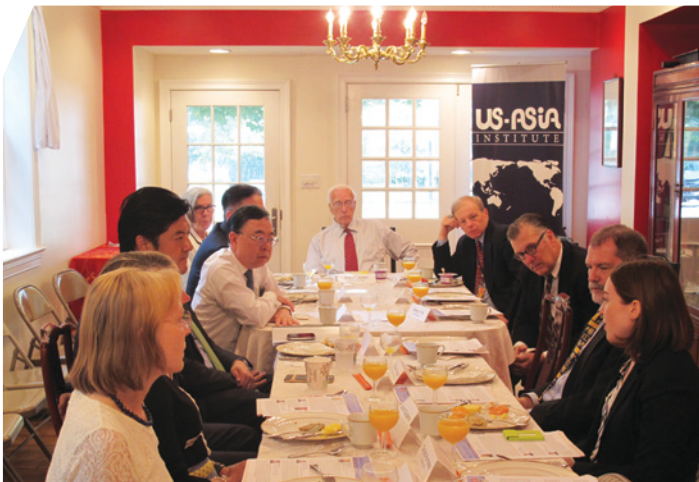
Capitol Hill Breakfast Meeting hosted by the U.S.-Asia Institute