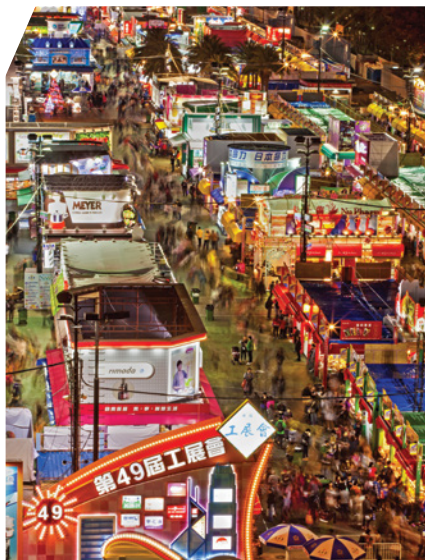
Gold award of the 49th Hong Kong Brands & Products Expo Photography Competition

Sponsored by the Better Hong Kong Foundation and organized by the Chinese Manufacturers' Association, the 50th Hong Kong Brands & Products Expo Photography Competition was held from 12 December 2015 to 4 January 2016. Community members were encouraged to express their wishes on quality-of-life and the future of Hong Kong through their photos.