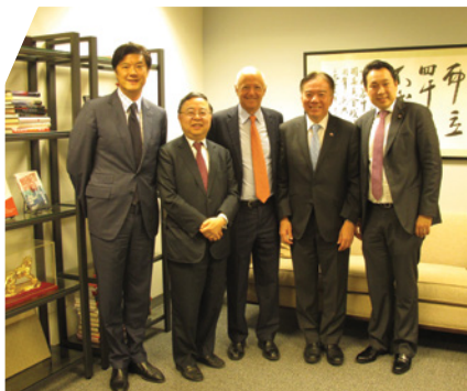
At the National Committee on U.S.-China Relations