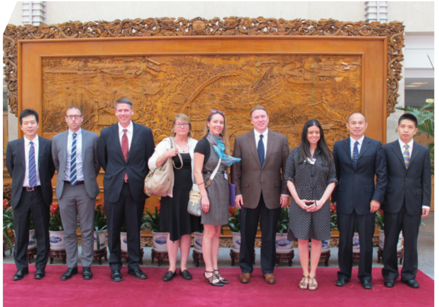
Meeting with Information Department and Department of North America and Oceania, Ministry of Foreign Affairs

In an effort to enhance the understanding of China and Hong Kong by the American media, since 1996 the Foundation has invited six to eight American journalists each year to visit China and Hong Kong. The Foundation sponsored and organized their trip. With the support of the Ministry of Foreign Affairs of the PRC, the program enables the journalists to meet with senior central government officials in Beijing and local municipal officials in one of the second or third tier cities in China. The Foundation also organizes meetings with key industry and business players, academic and research institutions and media figures to broaden the participants' network other than providing them an overview of the cities they have visited. This year, the Foundation, in association with the All-China Journalists Association (ACJA) and the East-West Center, organized the Sixth China-U.S. Journalists Exchange program, as an expansion of the original Hong Kong Journalism Fellows program by adding the visit of the Chinese