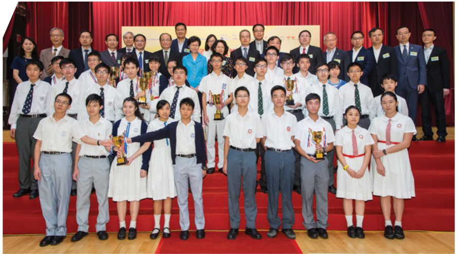
The Final was successfully held on 11 July 2015

Over 5,000 students from 66 primary and secondary schools participated in this year's contest. After first-round