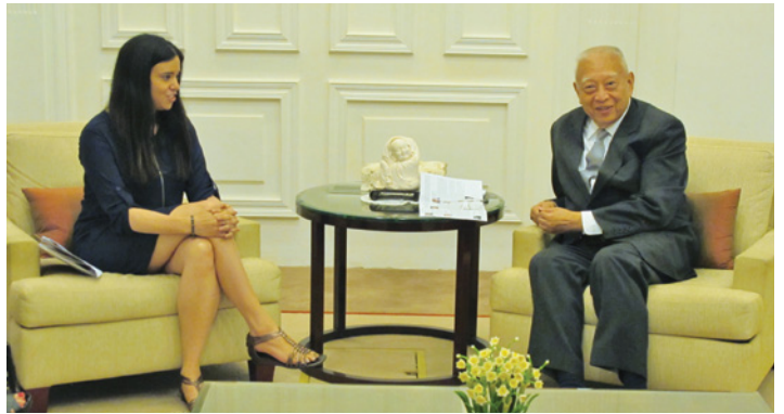
Meeting with Mr. Tung Chee-hwa, Vice Chairman of Chinese People's Political Consultative Conference and first Chief Executive of the HKSAR