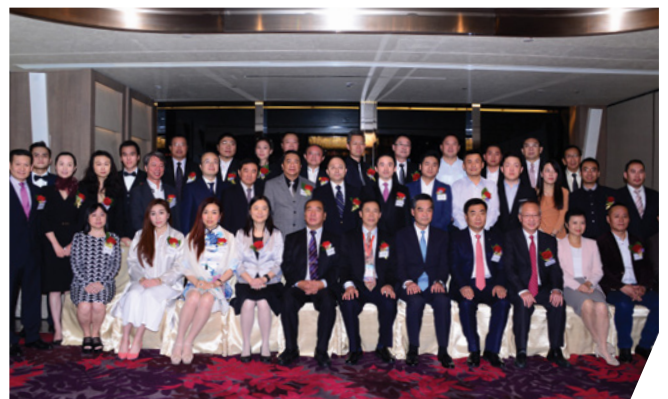
The Chief Executive Mr. Leung Chun-ying (row front, 5th right) was the Guest of Honor at the closing ceremony