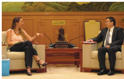
Meeting with Deputy Commissioner Song Ru'an, Office of Commissioner of the PRC's Ministry of Foreign Affairs in HKSAR