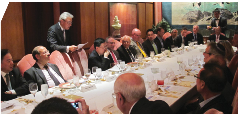
Dinner with Jewish associations in New York, hosted by the America China Public Affairs Institute