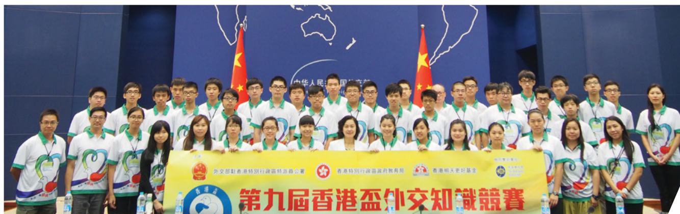
The group is excited to meet with Ms. Hua Chunying, Spokesperson and Deputy Director-General of the Information Department at the Blue Hall, the Ministry's press conference hall