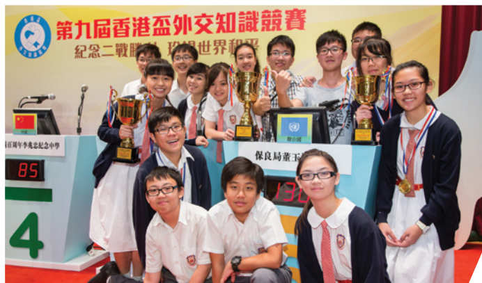
Po Leung Kuk Tung Yuk Tien College wins the championship again