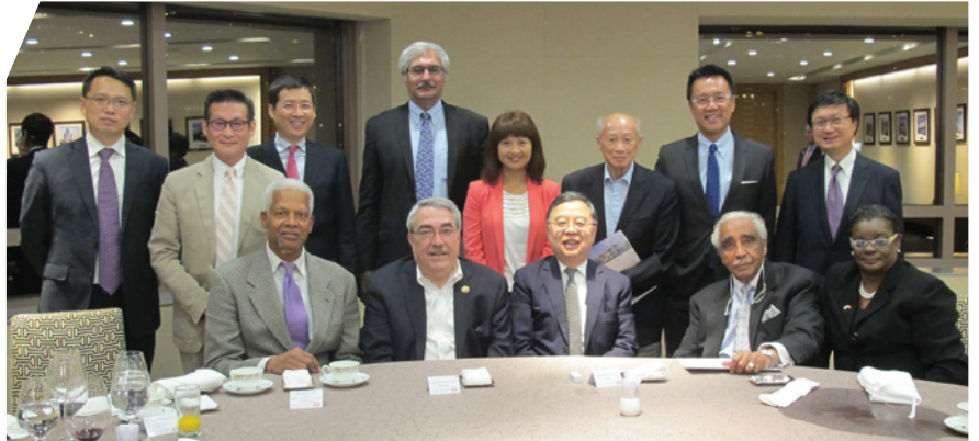
(Front row) With Congressman Henry C Johnson Jr (1st left), Congressman G K Butterfield (2nd left), Congressman Charles B Rangel (2nd right) and Congresswoman Gwen S Moore (1st right)

Dean of School of Business, The George Washington University, U.S.A.