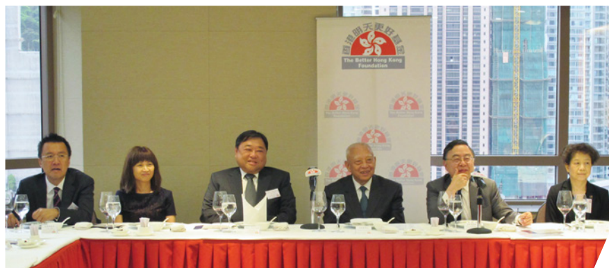
Meeting with Mr. Tung Chee-hwa, Vice Chairman of Chinese People's Political Consultative Conference and first Chief Executive of HKSAR

Since its establishment, the Foundation has made every effort to encourage dialogues and exchanges between Hong Kong, Mainland China and counterparts around the world. At our annual delegation to the U.S. led by the Foundation's Executive Committee Chairman Mr. Ronnie Chan in July, we met new friends and renewed friendships with our old connections inside the Beltway and New York, to share and exchange views on issues related to Hong Kong, Mainland China and in the U.S. Just before President Xi Jinping's visit to the U.S., the Foundation brought six senior U.S. journalists to Beijing, Xi'an and Hong Kong in early September, under the China-U.S. Journalists Exchange Program which was jointly organized with the All-China Journalists Association and the East-West Centre. The program