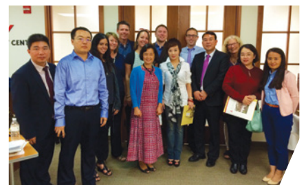
Chinese and U.S. journalists meet at Washington DC for exchange and dialogues