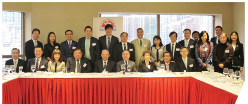
Sharing by Mr. Tung Chee-hwa (front row, middle)