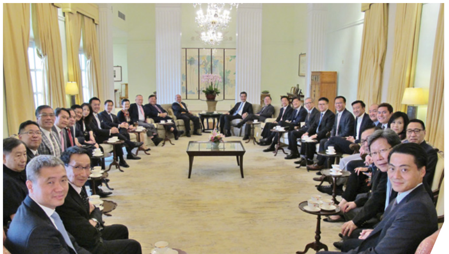
At the Government House