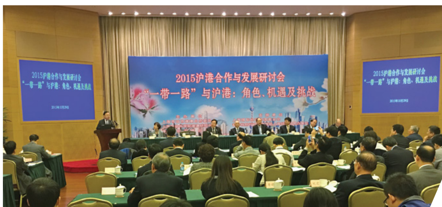
Discussions on the roles of Shanghai and Hong Kong in “One Belt, One Road” at the forum