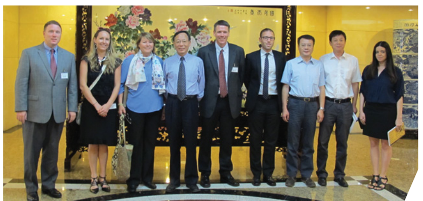
Meeting with National Development and Reform Commission