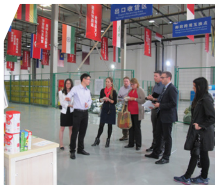
At Xi'an International Trade & Logistic Park