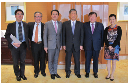
Meeting with Mr. Masahiko Komura (3rd right)