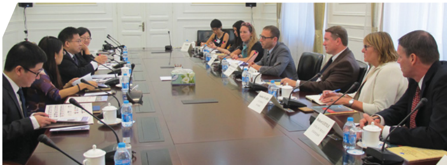
At China Institute of International Studies

A delegation of six senior U.S. journalists visited Beijing, Xi'an and Hong Kong from 5 – 16 September 2015 while five Chinese journalists visited New York and Washington D.C. in the U.S. during the same period. After their respective study tours, all Chinese and American journalists met in Washington D.C. to report on their experiences and to exchange opinions on how media coverage of each country can be improved. Through direct dialogue with local authorities and communities in different areas and seeing the developments for themselves, the U.S. journalists gained better understanding of the current situation and future development of Hong Kong and Mainland China.