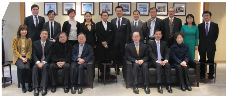
With Ambassador Liu Jieyi (front row, 3rd right)

Deputy Commissioner of the Ministry of Foreign Affairs in the HKSAR