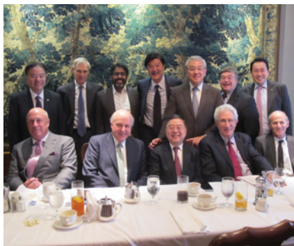
Luncheon hosted by America China Public Affairs Institute