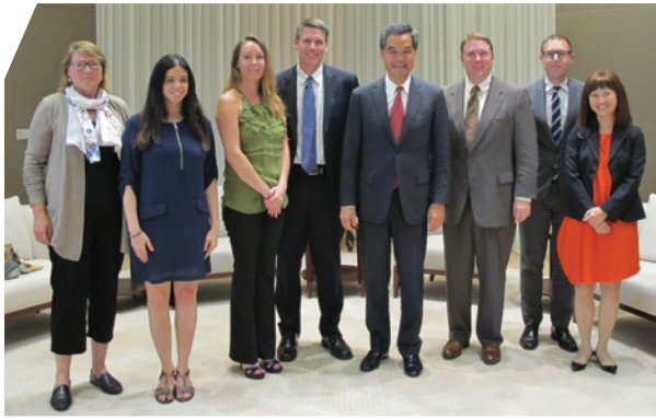
Meeting with Mr. Leung Chun-ying, Chief Executive (4th right)