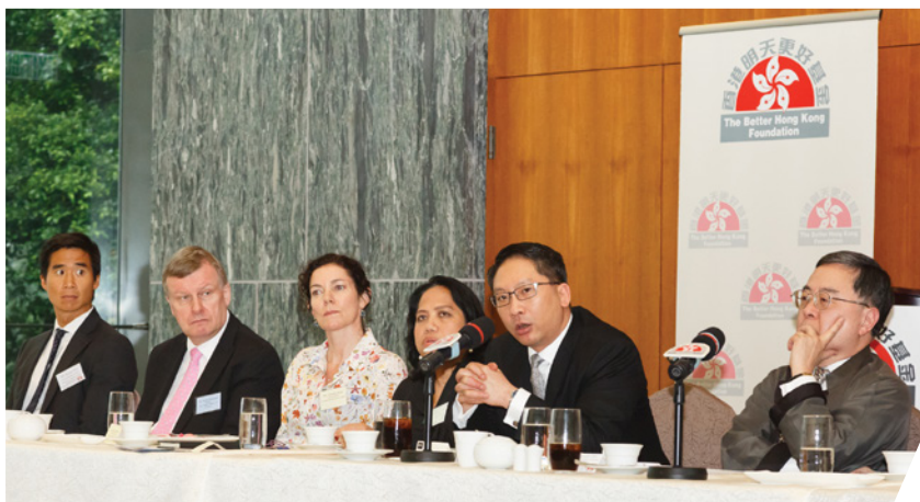
Spring Luncheon for Consuls General & Chairmen of International Chambers of Commerce in Hong Kong