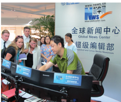
Visit to Xinhuanet