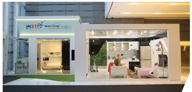
Exhibition at HKSTP

Organized by Hong Kong Science and Technology Parks Corporation (HKSTP) and supported by the Foundation, the campaign, consists of a series of activities from exhibitions, conferences, seminars, workshops to competitions, aims to promote sustainable living and to inspire the industry and general public on future city vision.