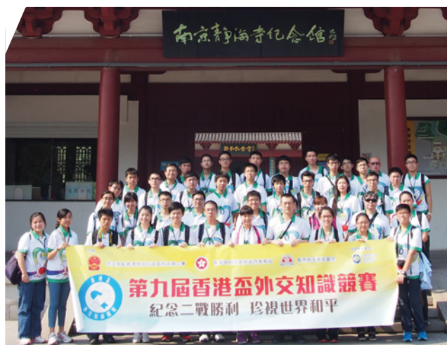
"Nanjing Treaty" Historical Gallery