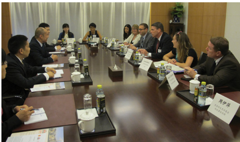
The China-U.S. Journalists Exchange