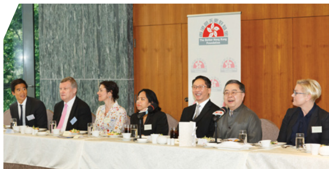
On behalf of the Foundation, Mr. Ronnie Chan (2nd right) welcomes Mr. Rimsky Yuen (3rd right) and all guests for joining the luncheon