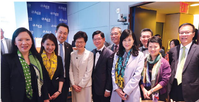
With Mrs. Carrie Lam (4th right) at the Asia Society speaking luncheon