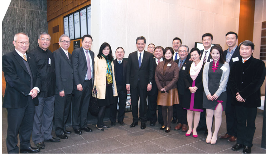
The Chief Executive Mr. Leung Chun-ying and the Foundation's Members at the Spring Luncheon for Consuls General & Chairmen of International Chambers of Commerce in Hong Kong

The "new normal" for China, with a growth of GDP at the rate of around 6.5%, is now mostly regarded by people as a reasonable and sustainable figure of growth. The launch of China's grand plan of "One Belt One Road" ("OBOR") is also perceived by many as an opportunity for new growth, development and collaboration for the countries along and around the area. The objective is to create win-win scenarios for all parties. Hong Kong, as an international