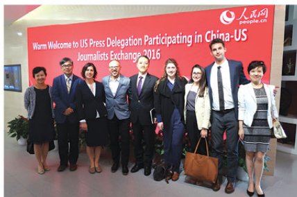
Visited People's Daily Online