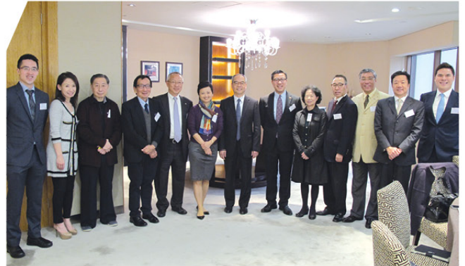
Mr. Lau Kong-wah (middle) shared his views on youth development in Hong Kong