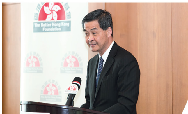
Speech by the Chief Executive Mr. Leung Chun-ying