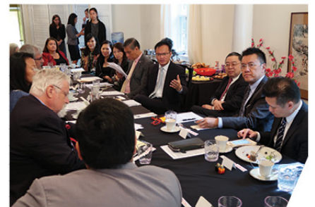
Capitol Hill Breakfast Meeting hosted by the U.S.-Asia Institute