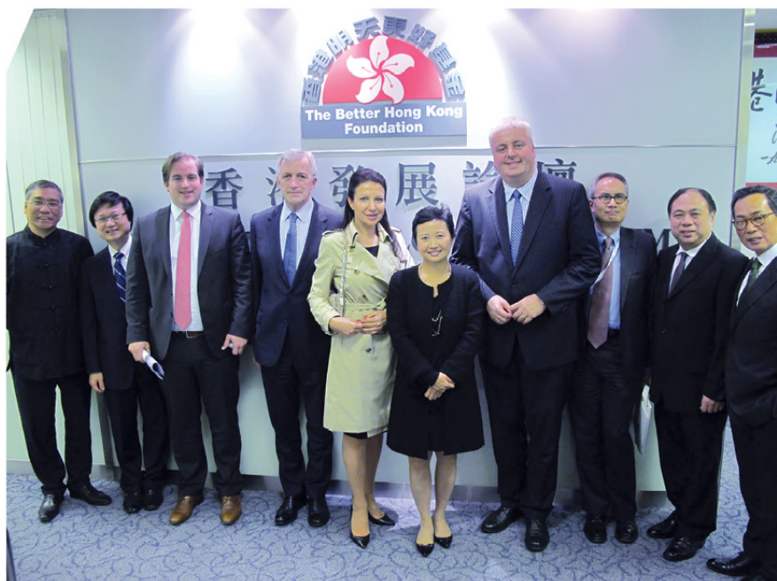
With members of European Parliament, EU