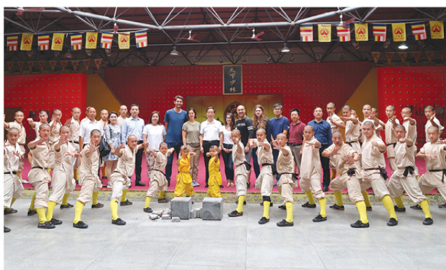
Visited Training Base of Warrior Monks Group of Songshan Shaolin Temple