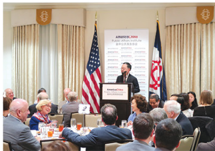
Speaking Luncheon hosted by the America China Public Affairs Institute