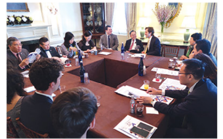
Meeting at the Council on Foreign Relations