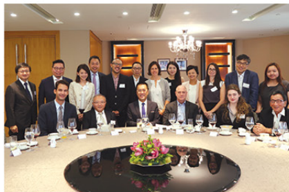
Members of the Foundation and guests exchanging views with the delegation on various issues