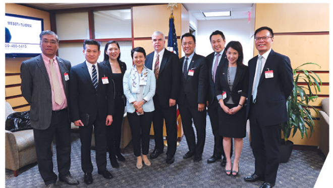
Meeting at the U.S. Department of State