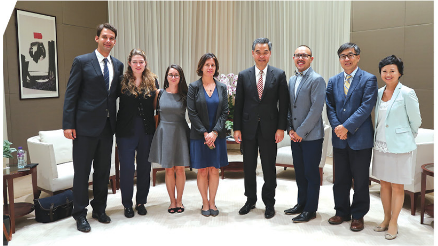
The Chief Executive Mr. Leung Chun-ying (4th right) met with the journalists