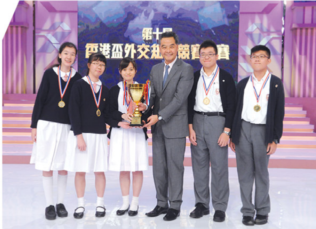
The Chief Executive Mr. Leung Chun-ying presented the Gold Award to Po Leung Kuk Tung Yuk Tien College