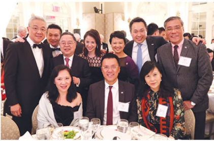
At the Hong Kong Association of New York Gala Dinner