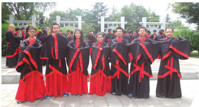
Students dressed up in Tong Dynasty's style