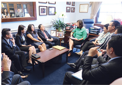
Meeting with Congresswoman Grace Meng (5th left)