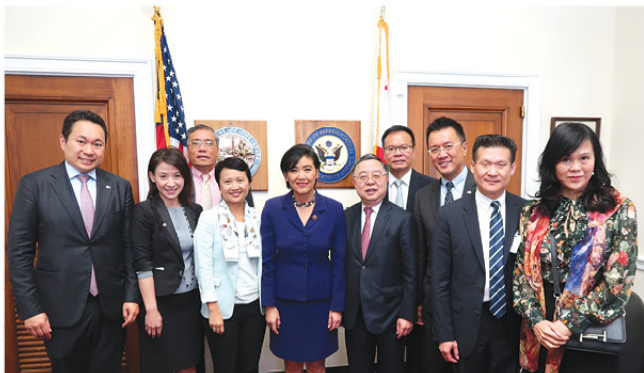
Meeting with Congresswoman Judy Chu (5th left)