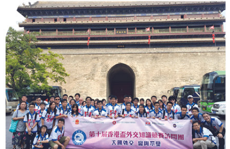
Group photo was taken in front of the ancient city wall in Xi'an