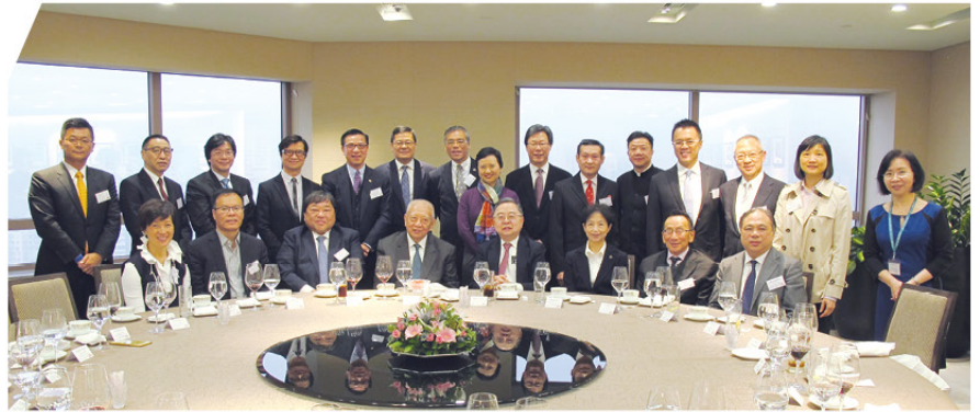
Mr. Tung Chee-hwa (front row, 4th left) shared his views with the Foundation's members