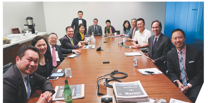
Meeting at Barron's