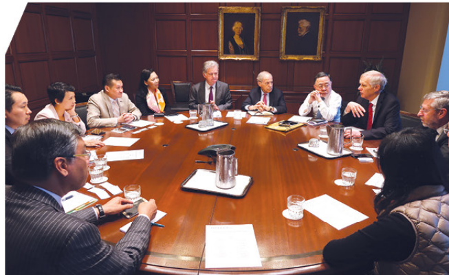
The Foundation’s Delegation to the United States

As Asia’s world city, Hong Kong is a great place for global thought leaders to meet. The Foundation had the opportunity to host some of them, including delegations of congressmen from the European Union (EU), the United Kingdom and New Zealand as well as congressional staffers from the U.S.; chairmen of chambers of commerce from Israel, Malaysia and Switzerland; innovation and technology experts from EU and Korea; a university dean from the U.S.; and a research center director from