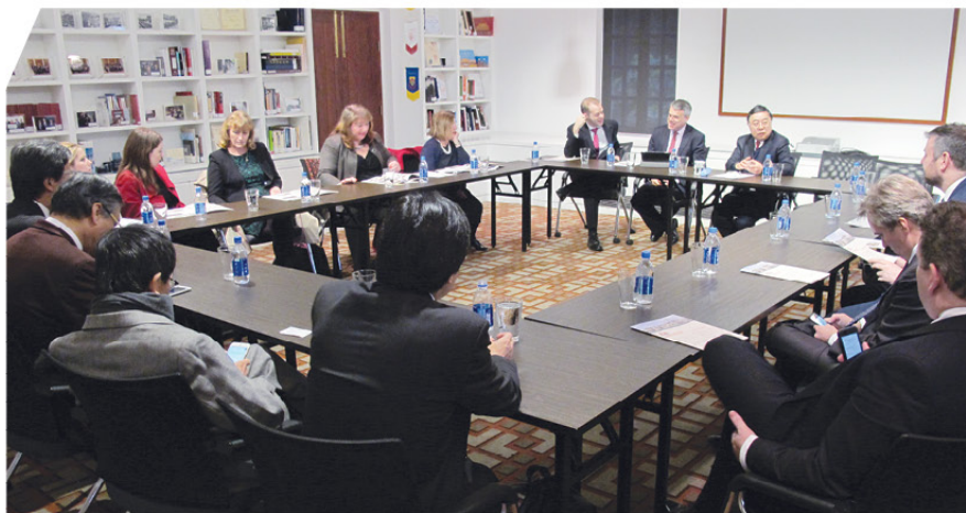
With Delegation of All Party Parliamentary China Group, UK

Delegation of All Party Parliamentary China Group, UK