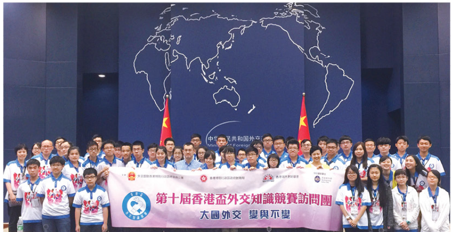
Students were thrilled to visit the Ministry of Foreign Affairs

From 30 July – 5 August 2016, a study tour to Beijing and Xi'an was organized for the winning teams. One of the highlights of the tour was a visit to the Ministry of Foreign Affairs in Beijing. Through the contest, we hope that young people and the general public in Hong Kong will become more interested in learning about the development of China in the context of world diplomacy.