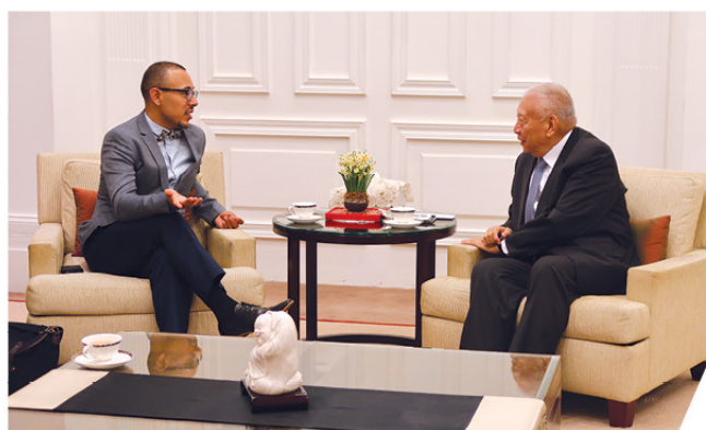
Meeting with Mr. Tung Chee-hwa, Vice Chairman of Chinese People's Political Consultative Conference and first Chief Executive of the HKSAR