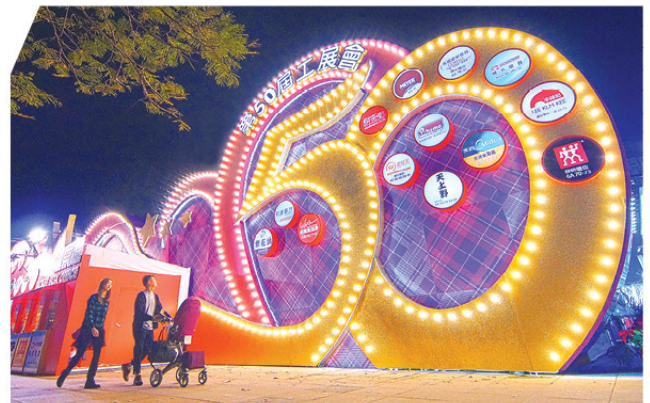
Gold award of the 50th Hong Kong Brands & Products Expo Photography Competition

Sponsored by the Better Hong Kong Foundation and organized by the Chinese Manufacturers' Association, the 51th Hong Kong Brands & Products Expo Photography Competition was held from 10 December 2016 to 2 January 2017. Community members were encouraged to express their wishes on quality-of-life and the future of Hong Kong through their photos.