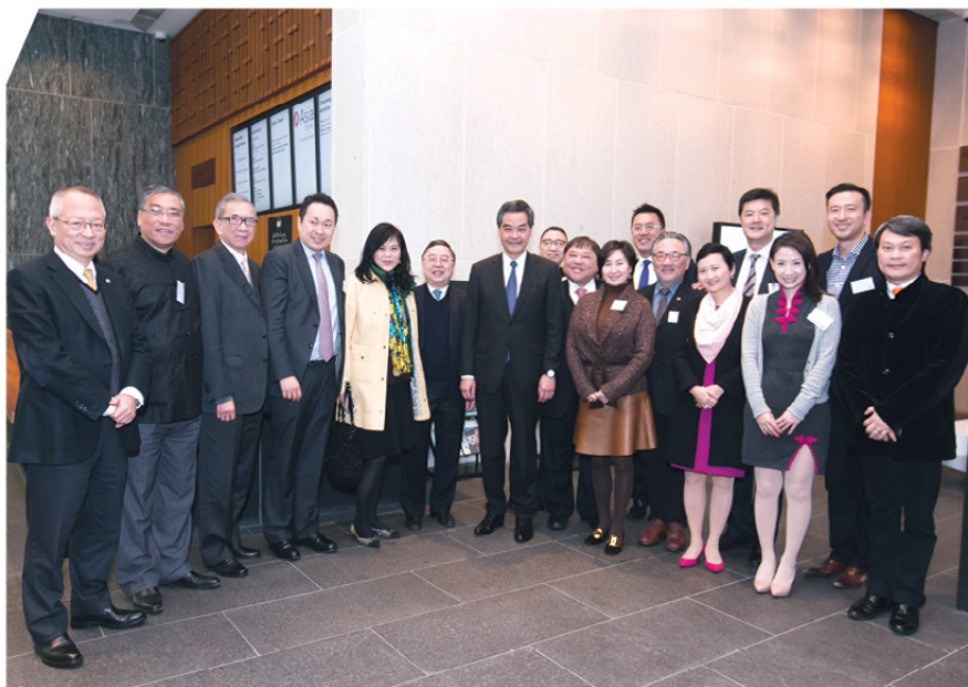
The Chief Executive Mr. Leung Chun-ying and members of the Foundation