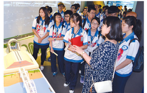
Students visited the Chinese Academy of Engineering