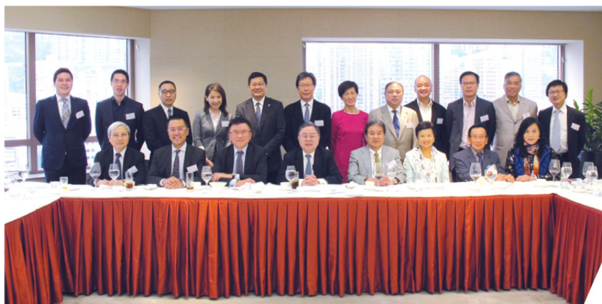
Prof. K C Chan (front row, 3rd left) shared his views on the future development of Hong Kong's economy