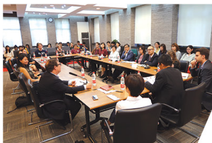
Meeting at School of Journalism and Communication, Tsinghua University