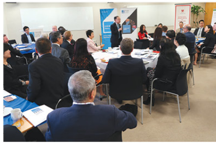
Breakfast meeting hosted by the Hong Kong Association of New York