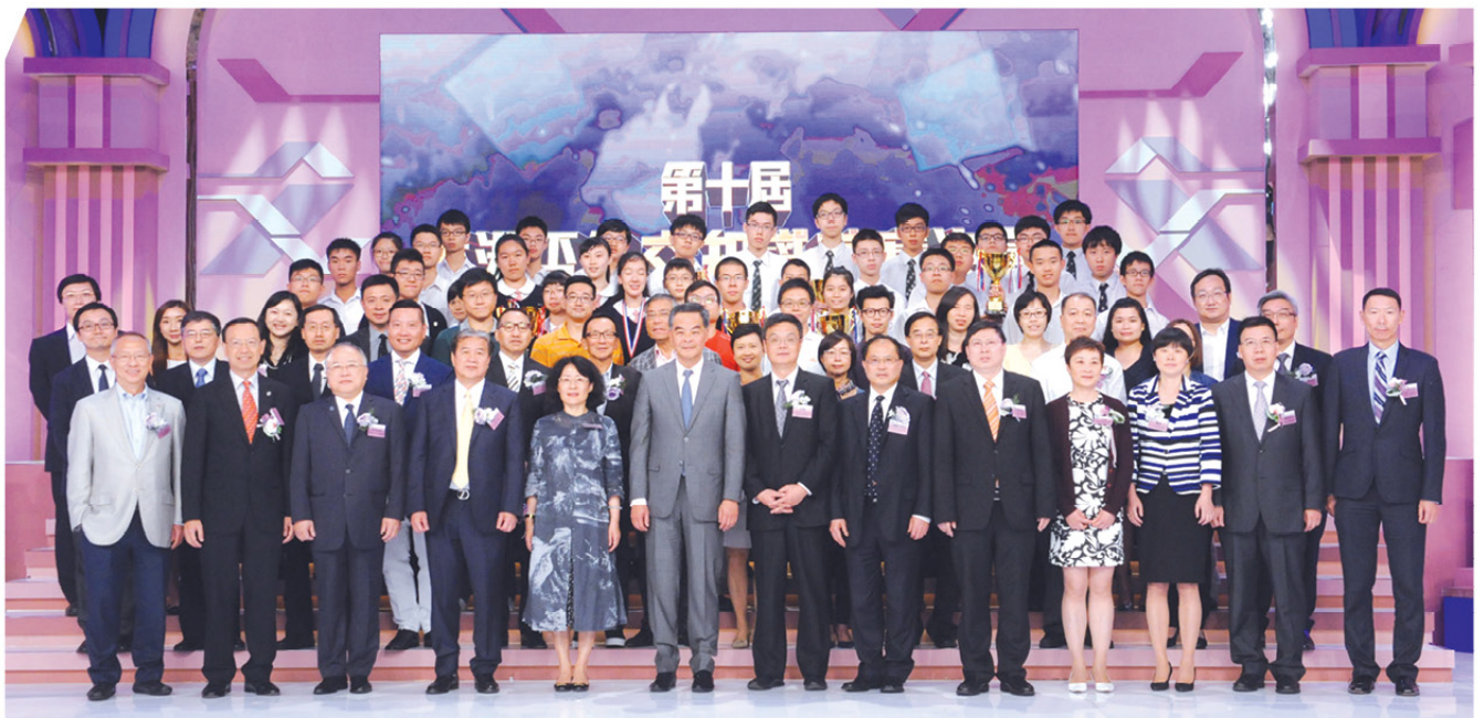
The Final was successfully held on 9 July

Po Leung Kuk Tung Yuk Tien College. The Final was held and recorded at the TVB studio and more than 400 audience member comprising students and teachers from primary and secondary schools were amazed by the excellent performances of the finalists. A special TV program about the contest was produced and broadcast on 16 July 2016. Besides the main contest, a T-Shirt design competition was also organized to encourage more participation from students.