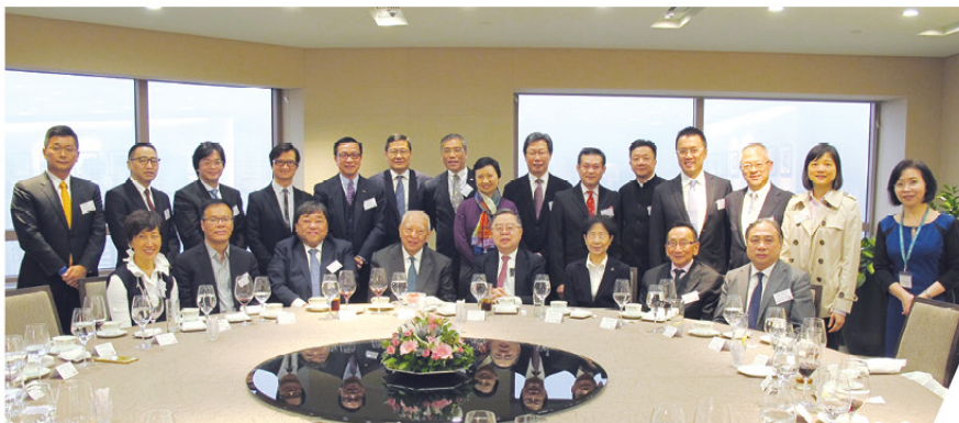
Meeting with Mr. Tung Chee-hwa, Vice Chairman of Chinese People's Political Consultative Conference and First Chief Executive of the HKSAR

With the light speed deployment of technology and social media, things are changing fast, so are public sentiments. The perceived impact of globalization, the good side and the bad side, is incredibly more obvious and views are diverse and polarized. We need leaders from all sides to work together and to engage the community to cope with the changes. And we need a community willing to be engaged and be patient. Let us join hands to listen to each other, take responsibility and be rational, so as to lead the world in the right direction and we look forward to an even better Hong Kong.