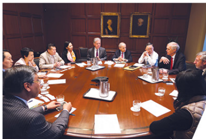
Meeting at the Brookings Institution