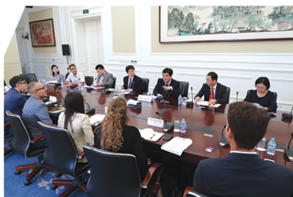
Meeting with experts at China Institute of International Studies