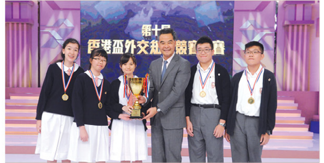
The 10th Hong Kong Cup Diplomatic Knowledge Contest

We also need to explore new opportunities for the sustainable growth of our society. In November, the Foundation together with the Shanghai Academy of Social Science and Shanghai CPPCC organized the annual Shanghai conference. Its purpose was to facilitate an in-depth discussion on how the two cities could leverage the advantages of each to maximize business potential, especially on the financial front, under the "One Belt, One Road" plan. Innovation and technology is another area which young people could develop and pursue excellence. Therefore, the Foundation supported the APAC Innovation Summit 2016 and Smart City Campaign organized by the Hong Kong Science and Technology Parks Corporation. We also supported various awards to recognize and showcase various business sectors for their achievements in corporate social responsibility and outstanding professionalism.