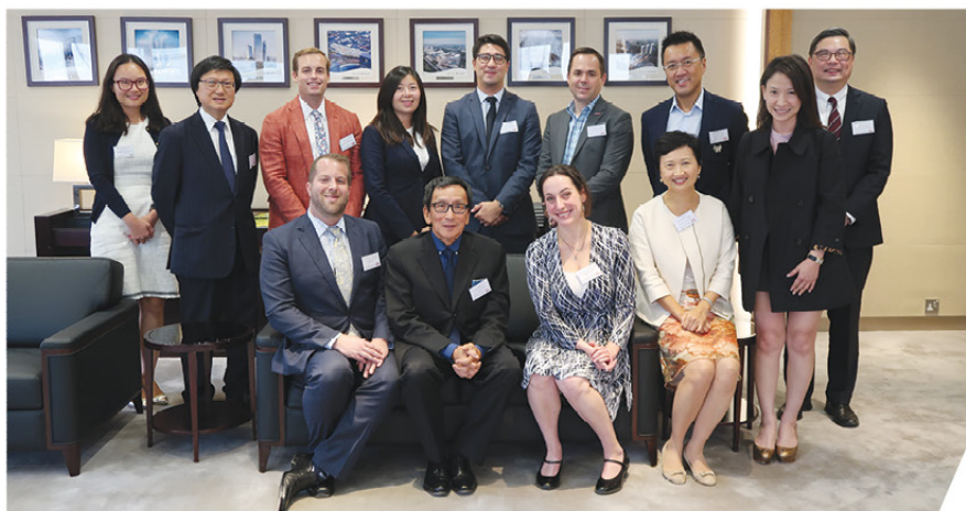
With the Delegation of U.S. Congressional Staffers