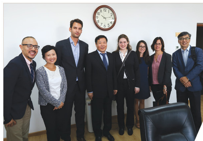
The China-U.S. Journalists Exchange

Switzerland. These meetings are truly fruitful since the leaders are thoughtful and inspirational and the network established are valuable.