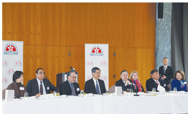
On behalf of the Foundation, Mr. Ronnie Chan (4th right) welcomed the Chief Executive Mr. Leung Chun-ying (4th left) and all guests for joining the luncheon