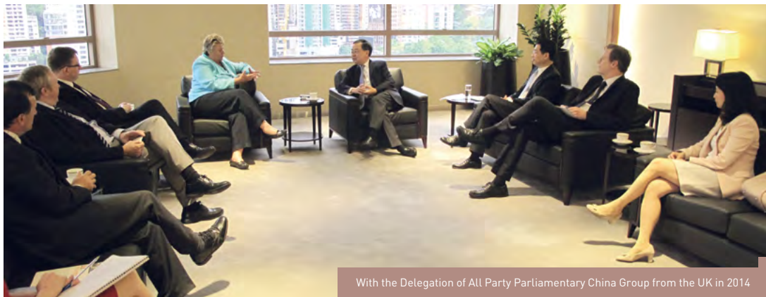
With the Delegation of All Party Parliamentary China Group from the UK in 2014