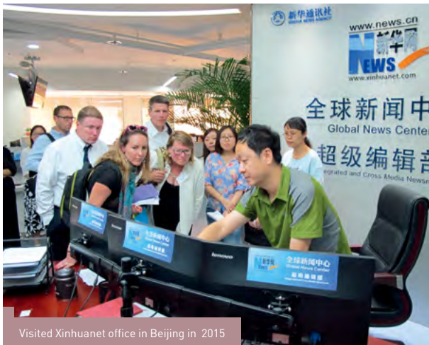
Visited Xinhuanet office in Beijing in 2015