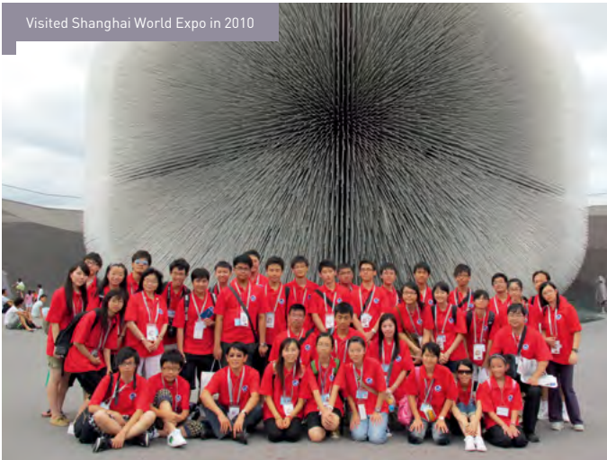
Visited Shanghai World Expo in 2010