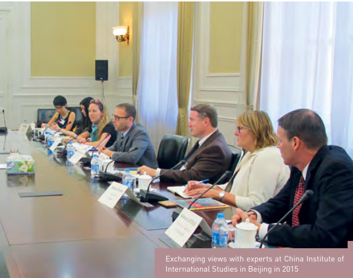
Exchanging views with experts at China Institute of International Studies in Beijing in 2015