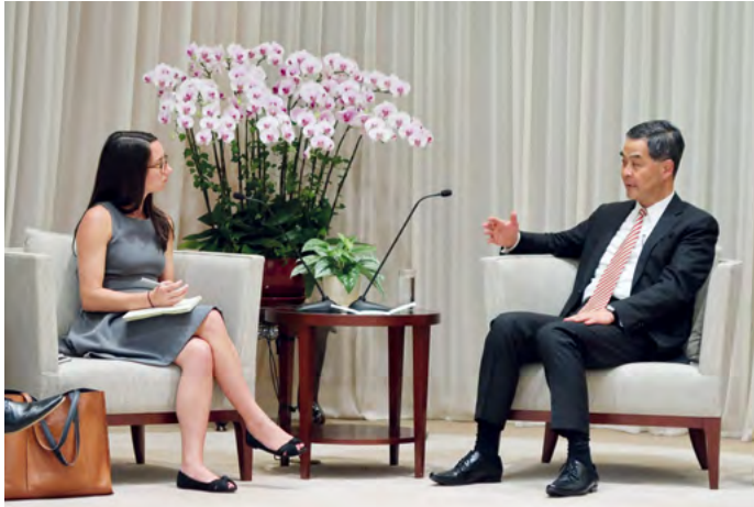
Meeting with the Chief Executive Mr. Leung Chun-ying in Hong Kong in 2016