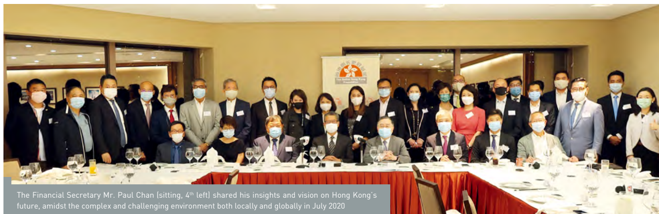
The Financial Secretary Mr. Paul Chan (sitting, 4 th left) shared his insights and vision on Hong Kong's future, amidst the complex and challenging environment both locally and globally in July 2020