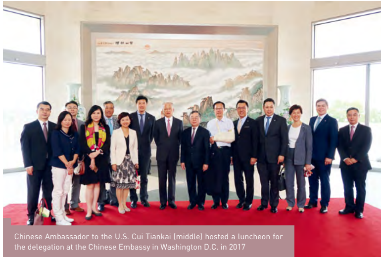
Chinese Ambassador to the U.S. Cui Tiankai (middle) hosted a luncheon for the delegation at the Chinese Embassy in Washington D.C. in 2017