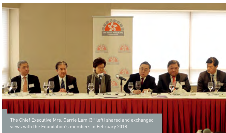
The Chief Executive Mrs. Carrie Lam (3 rd left) shared and exchanged views with the Foundation's members in February 2018