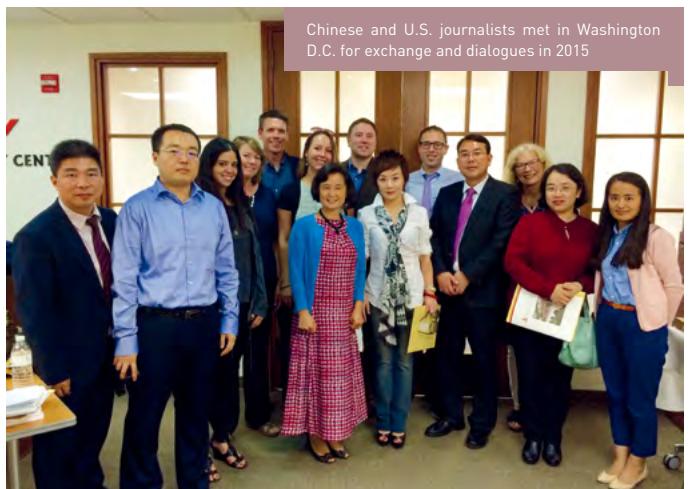
Chinese and U.S. journalists met in Washington D.C. for exchange and dialogues in 2015