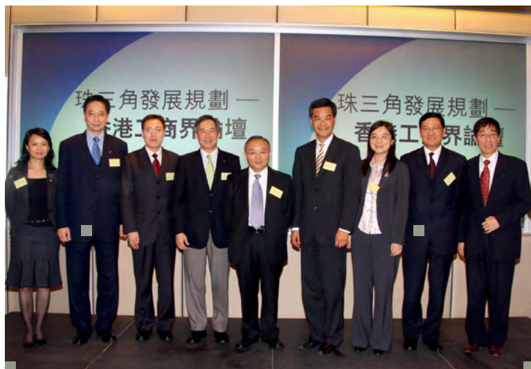
Jointly organized by the Foundation, the Central Policy Unit of the HKSAR Government and the Federation of Hong Kong Industries, the Hong Kong Business Community Forum on the Pearl River Delta Development Plan was successfully held at the City University of Hong Kong in 2009

In collaboration with various organizations, the Foundation co-organizes and supports conferences and forums to facilitate exchange of ideas and knowledge sharing.