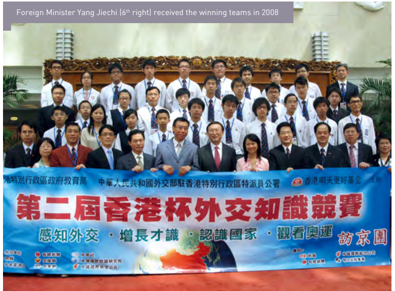
Foreign Minister Yang Jiechi (6 th right) received the winning teams in 2008