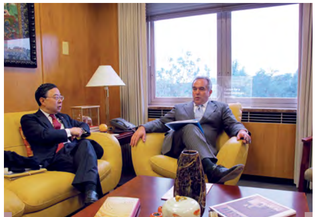
Meeting with Dr. Kurt Campbell (right), Assistant Secretary of State for East Asian & Pacific Affairs in 2010