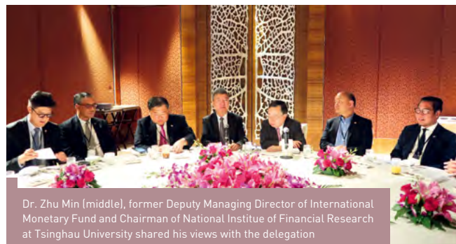
Dr. Zhu Min (middle), former Deputy Managing Director of International Monetary Fund and Chairman of National Institute of Financial Research at Tsinghua University shared his views with the delegation