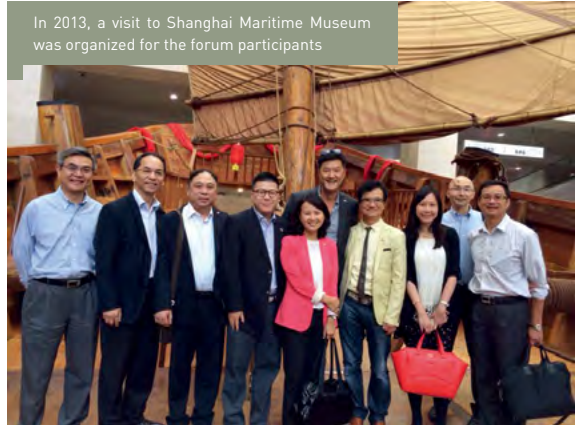
In 2013, a visit to Shanghai Maritime Museum was organized for the forum participants