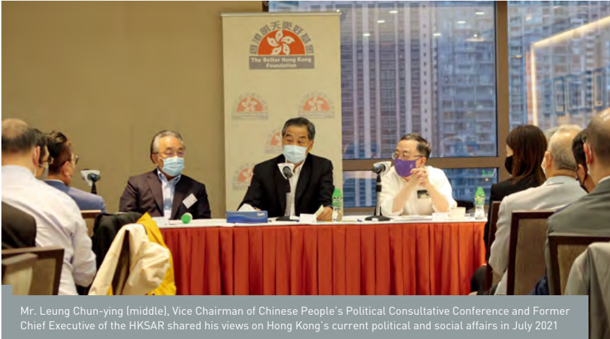
Mr. Leung Chun-ying (middle), Vice Chairman of Chinese People's Political Consultative Conference and Former Chief Executive of the HKSAR shared his views on Hong Kong's current political and social affairs in July 2021