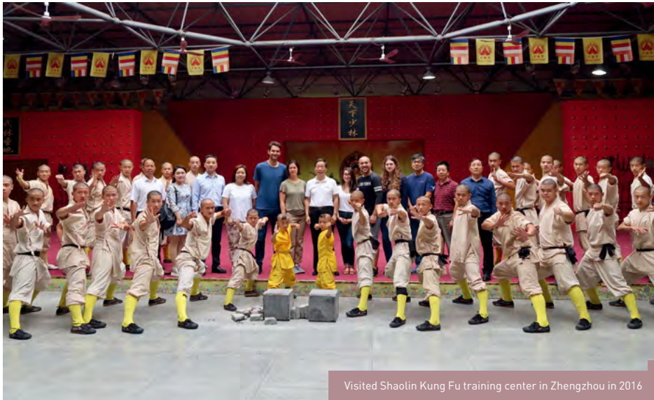
Visited Shaolin Kung Fu training center in Zhengzhou in 2016