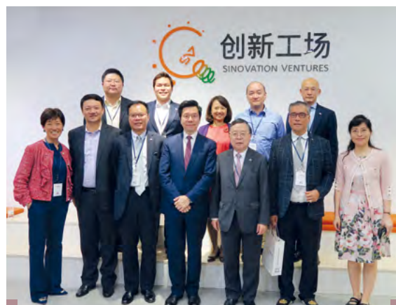
Dr. Lee Kai-fu (front row, middle), Chairman and CEO of Sinoation Ventures introduced the high-tech products of his company and hosted a dinner for the delegation