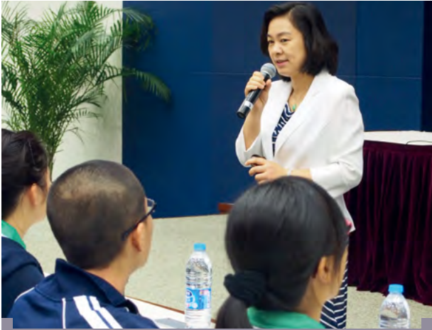
Sharing by Ms. Hua Chunying, Spokesperson and Deputy Director-General of the Information Department of the Ministry of Foreign Affairs in Beijing in 2015