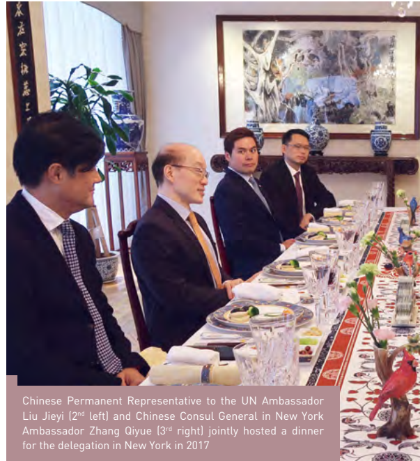
Chinese Permanent Representative to the UN Ambassador Liu Jieyi (2 nd left) and Chinese Consul General in New York Ambassador Zhang Qiyue (3 rd right) jointly hosted a dinner for the delegation in New York in 2017