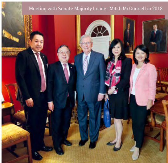
Meeting with Senate Majority Leader Mitch McConnell in 2018