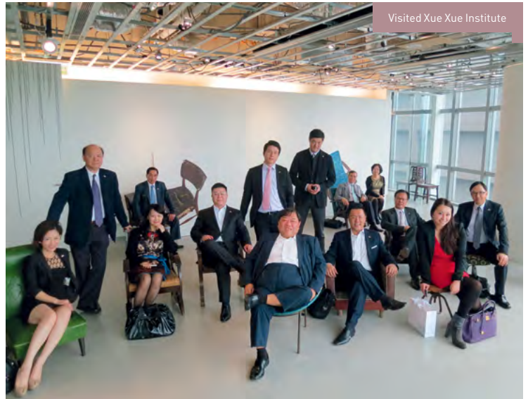
Visited Xue Xue Institute