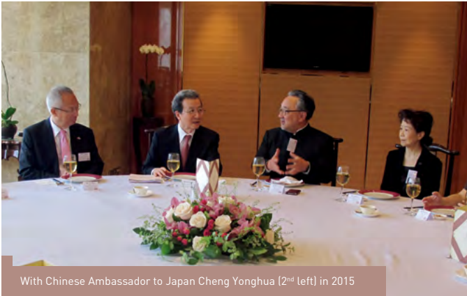
With Chinese Ambassador to Japan Cheng Yonghua (2 nd left) in 2015