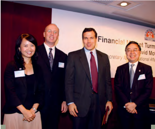
In 2008, Mr. David McCormick (2 nd right), Under Secretary for International Affairs of the U.S. Treasury Department spoke at a luncheon presentation jointly organized by the Foundation and the Asia Society Hong Kong Center