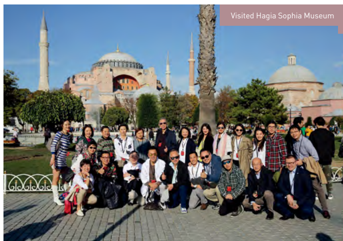
Visited Hagia Sophia Museum