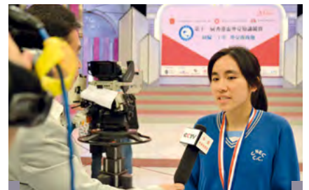
Awardee was interviewed by CCTV after the competition in 2017