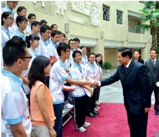
Vice Foreign Minister Zhang Yesui (right) received the winning teams in 2014