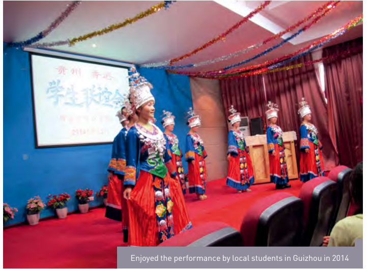
Enjoyed the performance by local students in Guizhou in 2014