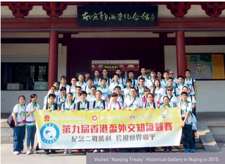
Visited "Nanjing Treaty" Historical Gallery in Nanjing in 2015