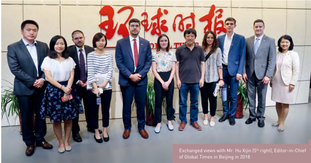
Exchanged views with Mr. Hu Xijin (5 th right), Editor-in-Chief of Global Times in Beijing in 2018