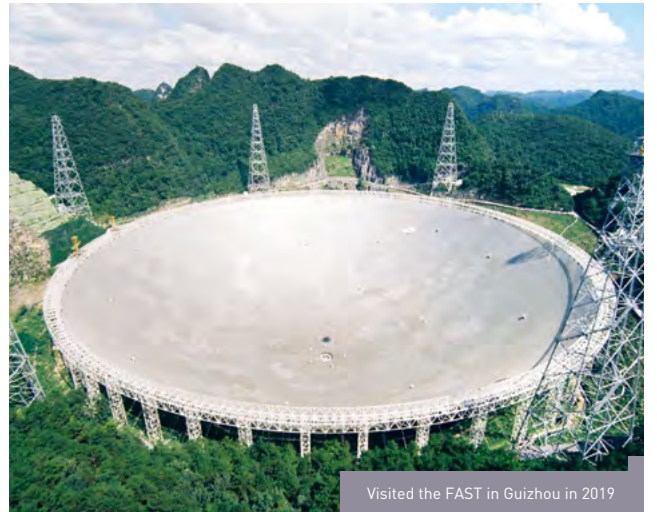
Visited the FAST in Guizhou in 2019