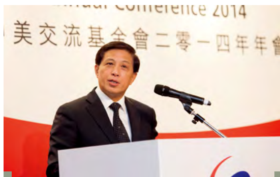
In 2014, Vice Foreign Minister of the PRC Mr. Zhang Yesui was invited to speak at the China-United States Exchange Foundation's annual conference. The Foundation was one of the co-organizers