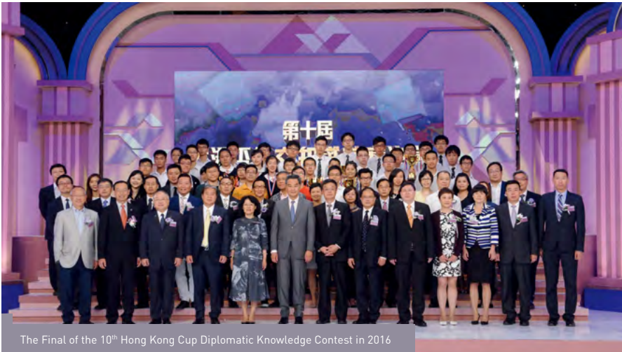
The Final of the 10 th Hong Kong Cup Diplomatic Knowledge Contest in 2016