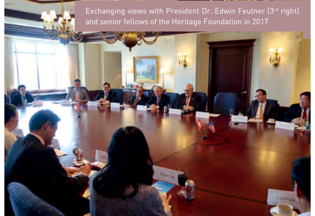
Exchanging views with President Dr. Edwin Feulner (3 rd right) and senior fellows of the Heritage Foundation in 2017