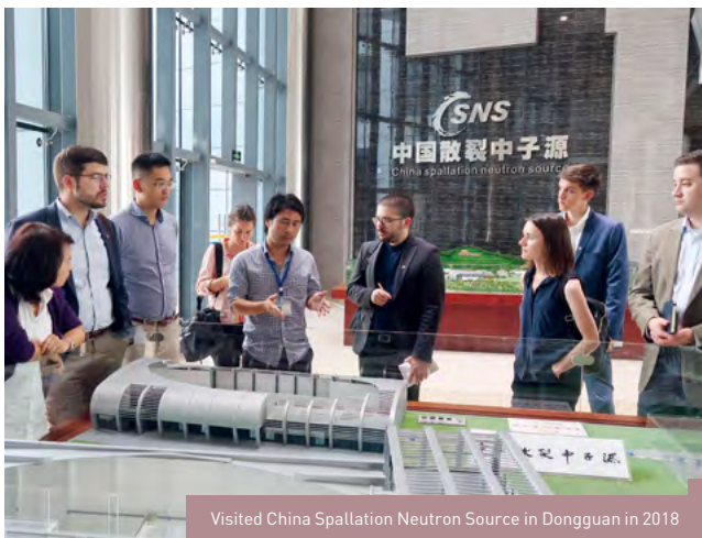
Visited China Spallation Neutron Source in Dongguan in 2018