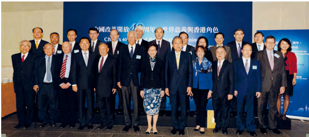
Jointly organized by the Foundation and the Office of Commissioner of the PRC's Ministry of Foreign Affairs in the HKSAR, the conference on "China's 40 Years of Reform and Opening up: Implications for the World and Role of Hong Kong" gathered international political leaders, senior government officials, prominent scholars and business leaders to share their experiences and insights in 2018