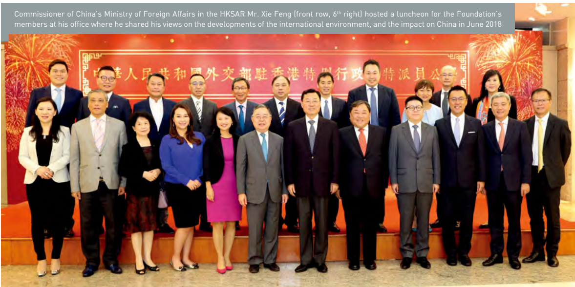
Commissioner of China's Ministry of Foreign Affairs in the HKSAR Mr. Xie Feng [front row, 6 th right] hosted a luncheon for the Foundation's members at his office where he shared his views on the developments of the international environment, and the impact on China in June 2018