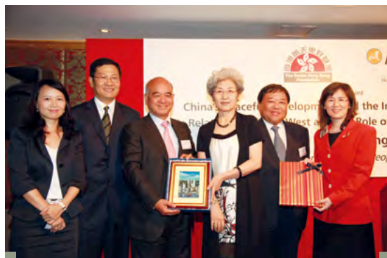
In 2011, Vice Foreign Minister of the PRC Ms. Fu Ying (3 rd right) spoke at an evening presentation jointly organized by the Foundation and the Asia Society Hong Kong Center