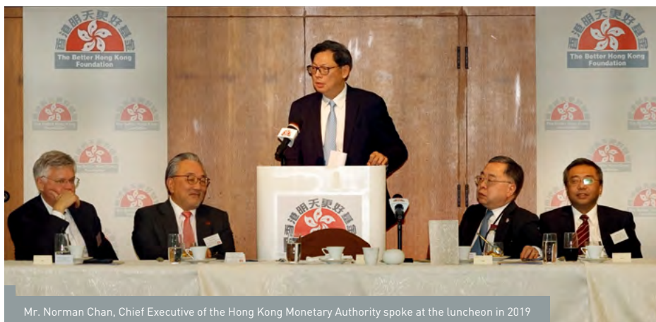
Mr. Norman Chan, Chief Executive of the Hong Kong Monetary Authority spoke at the luncheon in 2019