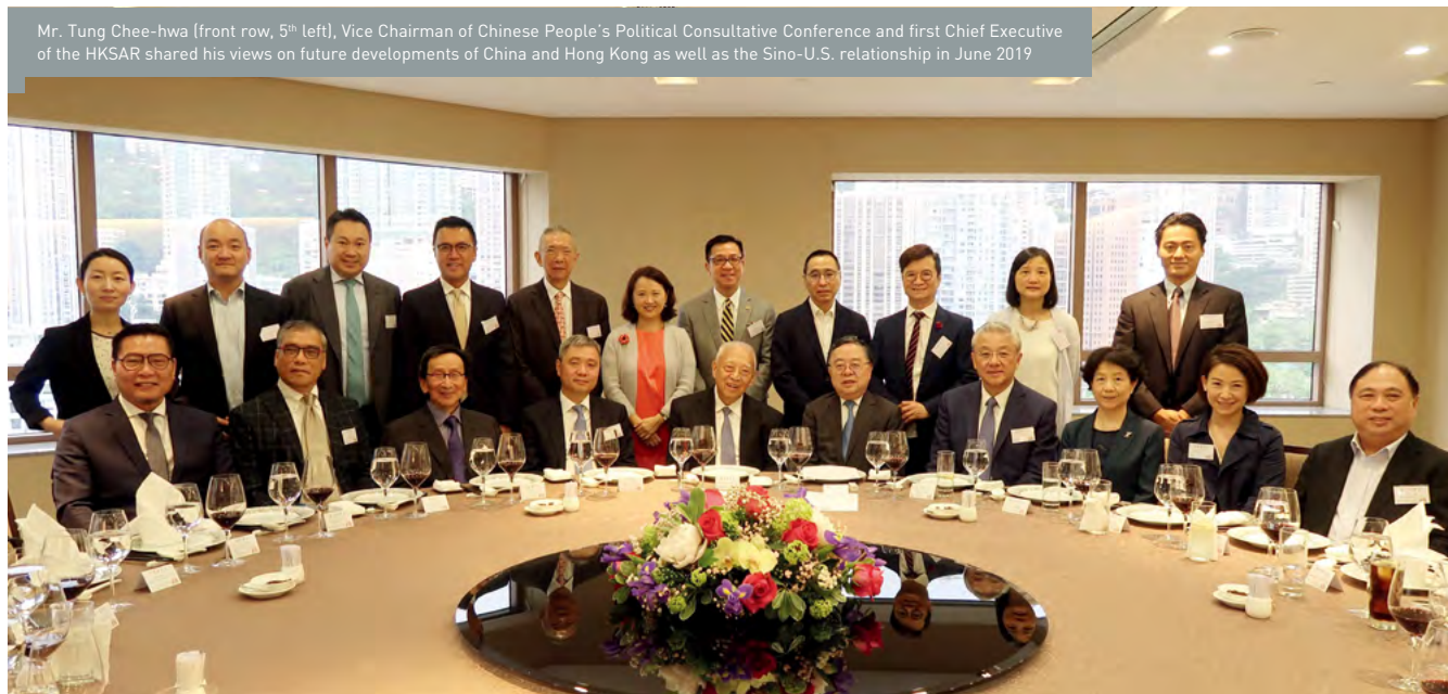
Mr. Tung Chee-hwa (front row, 5 th left), Vice Chairman of Chinese People's Political Consultative Conference and first Chief Executive of the HKSAR shared his views on future developments of China and Hong Kong as well as the Sino-U.S. relationship in June 2019

The Foundation always invites local and overseas community and thoughts leaders to share and exchange views on current social affairs.