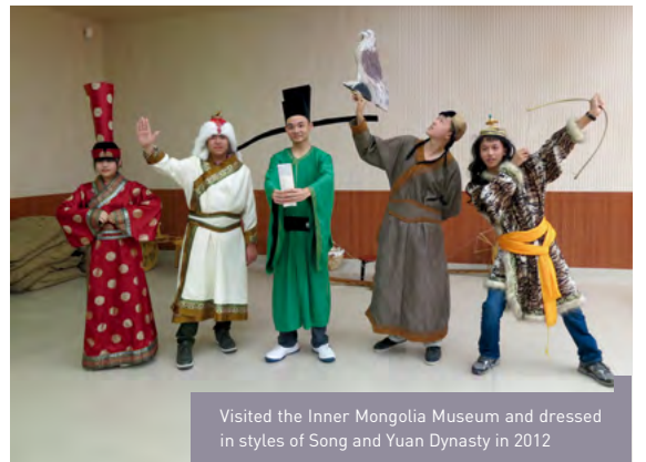
Visited the Inner Mongolia Museum and dressed in styles of Song and Yuan Dynasty in 2012