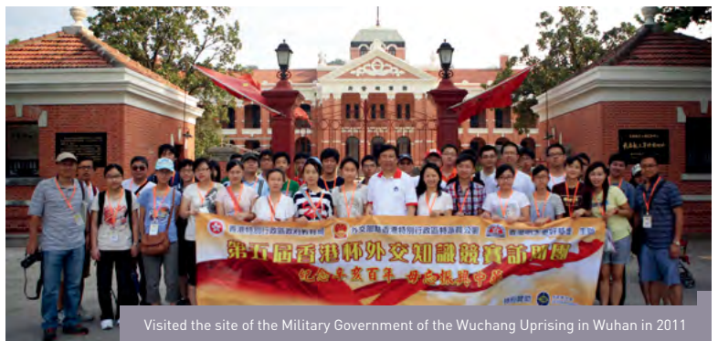
Visited the site of the Military Government of the Wuchang Uprising in Wuhan in 2011