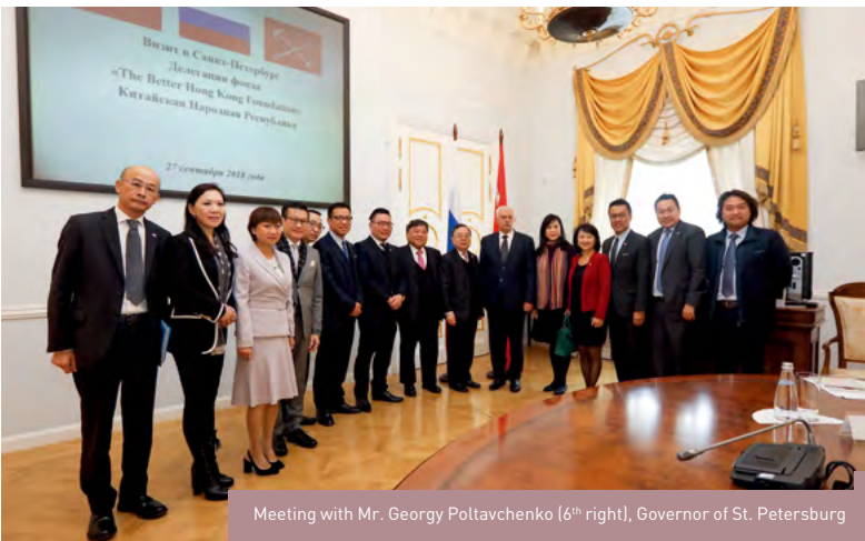
Meeting with Mr. Georgy Poltavchenko (6 th right), Governor of St. Petersburg