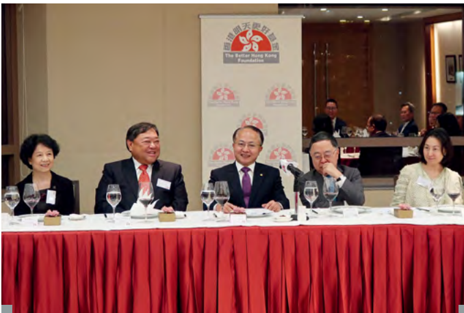
Mr. Wang Zhimin (middle), Director of the Liaison Office of the Central People's Government in the HKSAR discussed and exchanged views with the Foundation's members in June 2018