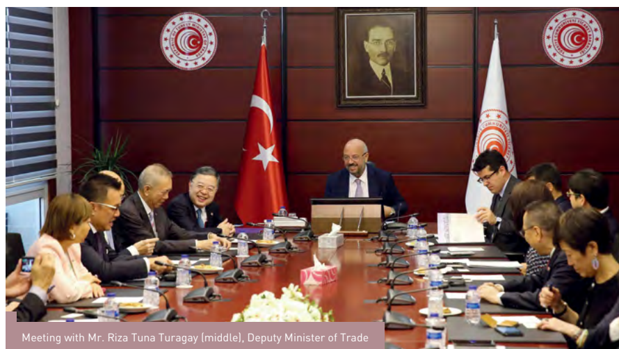
Meeting with Mr. Riza Tuna Turagay (middle), Deputy Minister of Trade