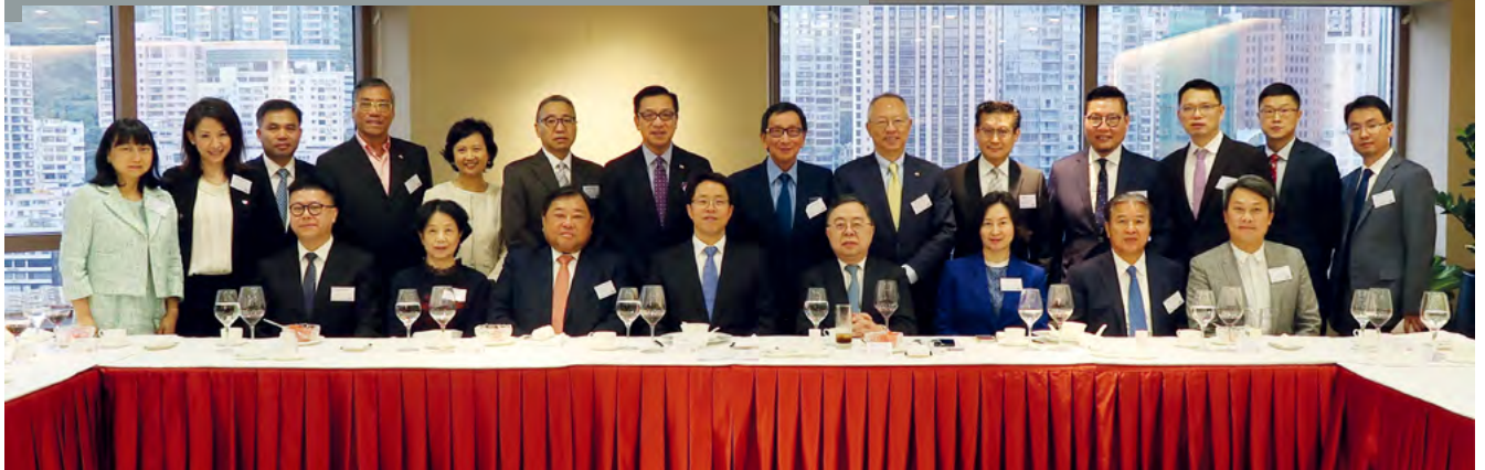
Mr. Zhang Xiaoming (front row, 4 th left), Director of the Liaison Office of the Central People's Government in the HKSAR discussed and exchanged views with the Foundation's members in May 2017