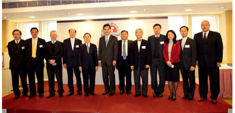
In 2011, the Foundation, together with the Chinese General Chamber of Commerce, the Chinese Manufacturers' Association of Hong Kong, the Federation of Hong Kong Industries, Hong Kong Chiu Chow Chamber of Commerce's Young Executives Committee, Hong Kong General Chamber of Commerce's China Committee and the Hong Kong General Chamber of Small and Medium Business, invited the Convenor of the Executive Council Mr. Leung Chun-ying (6 th left) to share views on Hong Kong's future position under the national plan