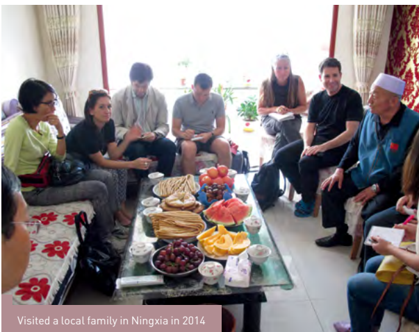
Visited a local family in Ningxia in 2014