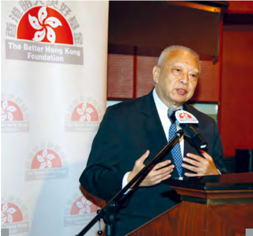
Mr. Tung Chee-hwa, Vice Chairman of Chinese People's Political Consultative Conference and first Chief Executive of the HKSAR was invited to address the luncheon in 2010