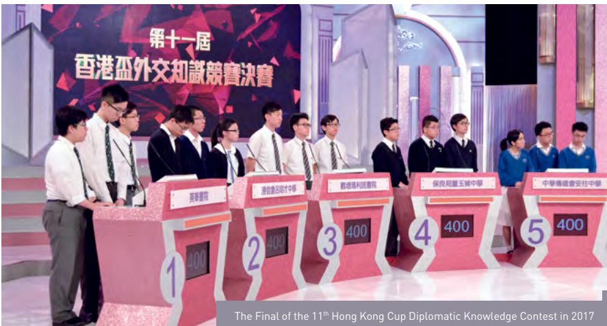
The Final of the 11 th Hong Kong Cup Diplomatic Knowledge Contest in 2017