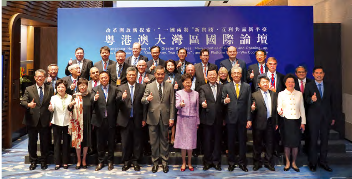
Jointly organized by the HKSAR Government and the Office of Commissioner of the PRC's Ministry of Foreign Affairs in the HKSAR, and supported by the Foundation, the International Forum on the Guangdong-Hong Kong-Macao Greater Bay Area was successfully held in 2019