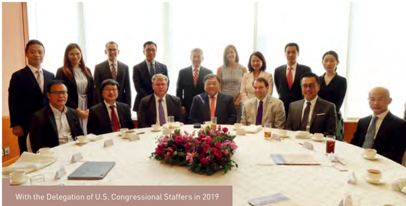
With the Delegation of U.S. Congressional Staffers in 2019