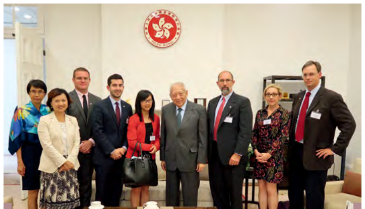
Meeting with Mr. Tung Chee-hwa (4 th right), Vice Chairman of Chinese People's Political Consultative Conference and first Chief Executive of the HKSAR in Hong Kong in 2017