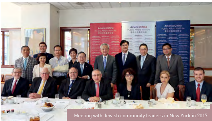
Meeting with Jewish community leaders in New York in 2017