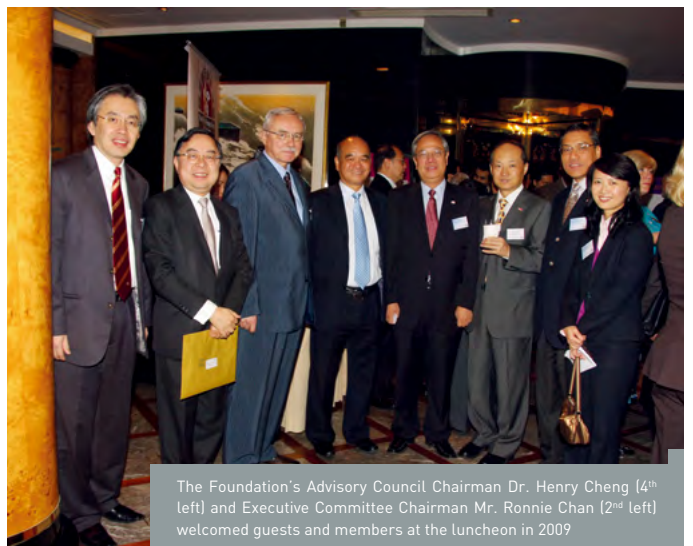
The Foundation's Advisory Council Chairman Dr. Henry Cheng (4 th left) and Executive Committee Chairman Mr. Ronnie Chan (2 nd left) welcomed guests and members at the luncheon in 2009