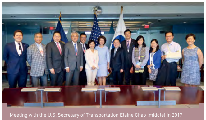
Meeting with the U.S. Secretary of Transportation Elaine Chao (middle) in 2017