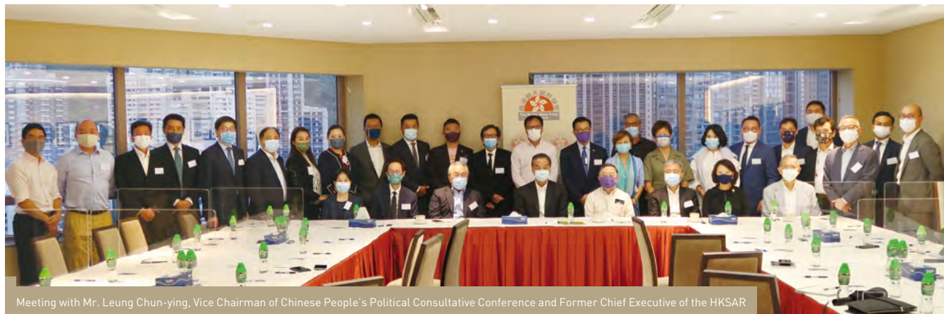
Meeting with Mr. Leung Chun-ying, Vice Chairman of Chinese People’s Political Consultative Conference and Former Chief Executive of the HKSAR