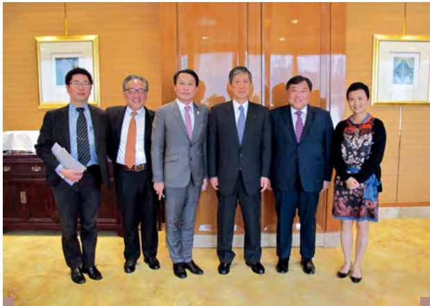
With Mr. Masahiko Komura (3 rd right), Chairman of Japan-Hong Kong Parliamentarians League from Japan in 2015