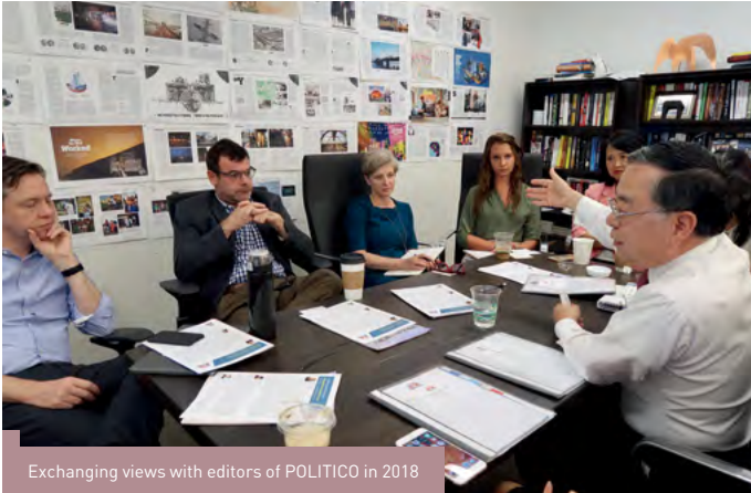
Exchanging views with editors of POLITICO in 2018