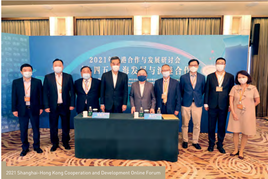
2021 Shanghai-Hong Kong Cooperation and Development Online Forum

Executive Director The Better Hong Kong Foundation