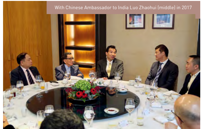
With Chinese Ambassador to India Luo Zhaohui (middle) in 2017