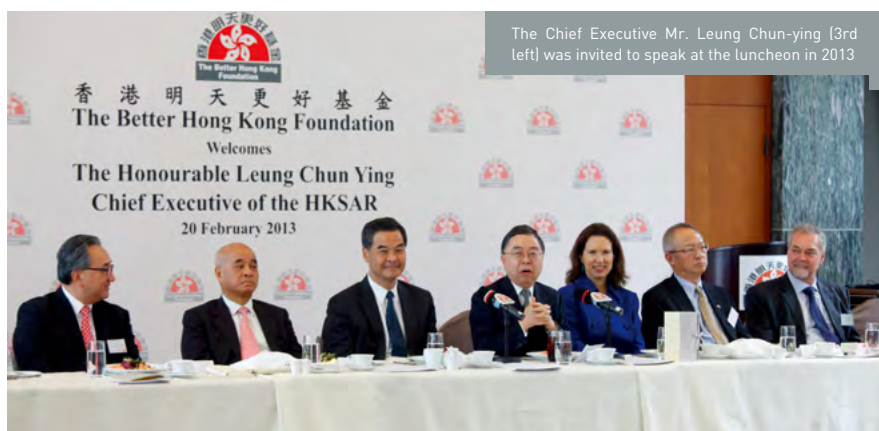
The Chief Executive Mr. Leung Chun-ying (3rd left) was invited to speak at the luncheon in 2013

At the beginning of Chinese New Year every year, the Foundation always organizes a Spring Speaking Luncheon for the Foundation's members, Consuls General and chairmen of international chambers of commerce in Hong Kong. A community leader will be invited to address on the occasion. The Foundation takes this opportunity to share our views and wishes on the development of Hong Kong and the world for the coming year.