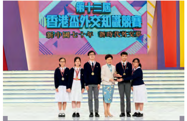
The Chief Executive Mrs. Carrie Lam presented the Gold Award of the Elite Group to Po Leung Kuk Tung Yuk Tien College in 2019

Launched in 2007, the Foundation jointly organized the Hong Kong Cup Diplomatic Knowledge Contest with the Office of Commissioner of the PRC's Ministry of Foreign Affairs in the HKSAR and the Education Bureau of the HKSAR Government for 13 consecutive years. The Contest aims to raise students' interest in international affairs and knowledge of the nation's foreign policy. More than 300,000 students from 164 primary and secondary schools have participated in the Contest so far. Study tours to Beijing and other Mainland cities such as Shanghai, Harbin, Hohhot, Nanjing, Xi'an, Guiyang and more, have been organized for the winning teams of the Contest. Through the Contest, it is hoped that young people and the general public in Hong Kong will become more interested in learning about the development of China in the context of world diplomacy.