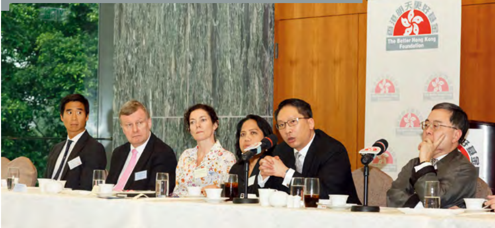
The Secretary for Justice Mr. Rimsky Yuen (2 nd right) gave a speech at the luncheon in 2015