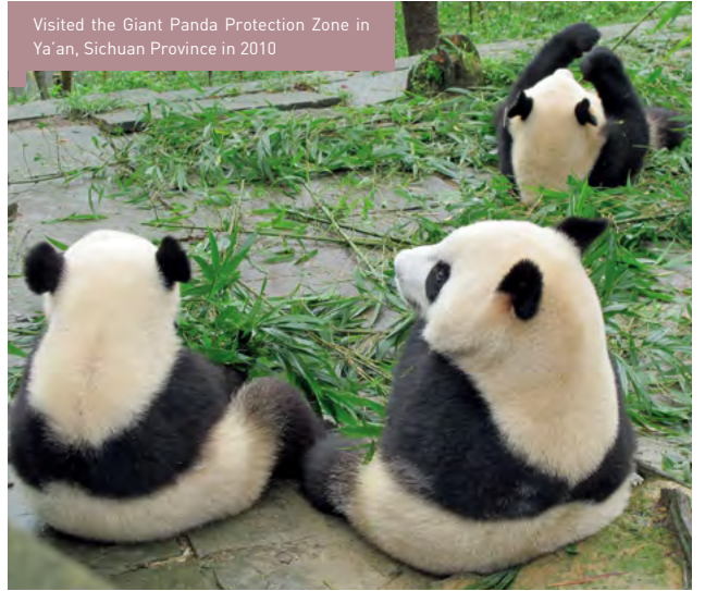
Visited the Giant Panda Protection Zone in Ya'an, Sichuan Province in 2010