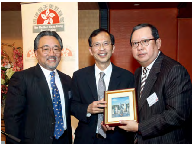
Mr. Jasper Tsang, President of the Legislative Council (middle) spoke at the luncheon in 2011