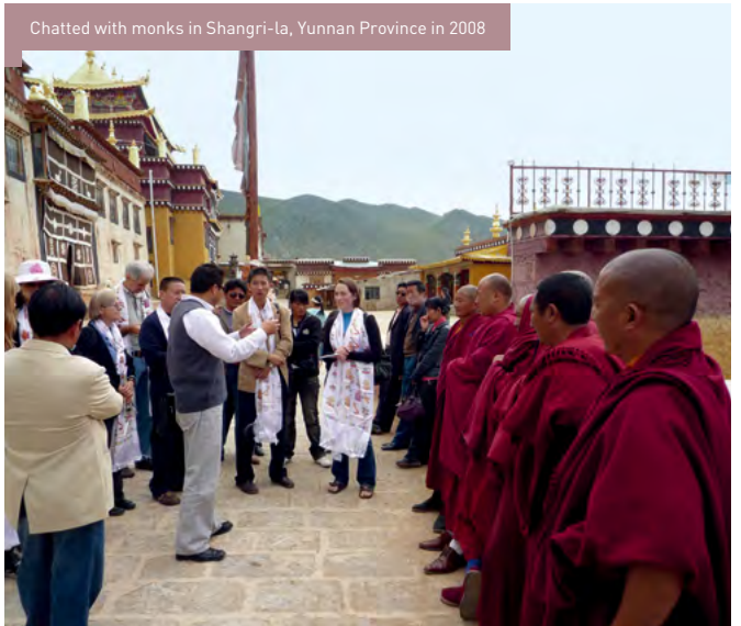
Chatted with monks in Shangri-la, Yunnan Province in 2008