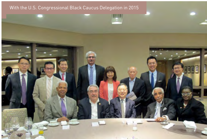
With the U.S. Congressional Black Caucus Delegation in 2015