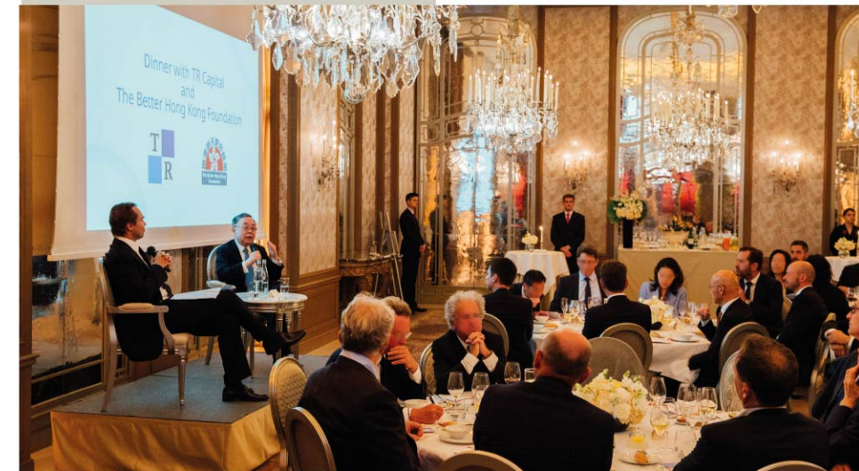
The BHKF delegation met with business community leaders in Paris in May 2023

Building on their successful initiatives in the Middle East, the BHKF prioritized strengthening connections with European partners. With the European Union's increased emphasis on diplomatic sovereignty, the BHKF found a receptive environment for their outreach efforts in the Hong Kong business sector.