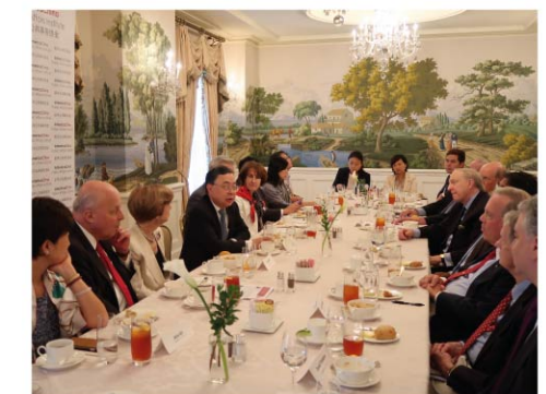
The Better Hong Kong Foundation organized high-level delegations to the United States for more than twenty years to foster communication and understanding

As a "super-connector", the BHKF has been at the forefront of facilitating communication and engagement between Hong Kong, mainland China, and the rest of the world. By actively engaging with opinion leaders and organizing high-level delegation visits, the BHKF keeps the international community informed about the latest developments in Hong Kong. These visits have proven influential, reshaping perceptions and leading to recognition of Hong Kong's remarkable growth.