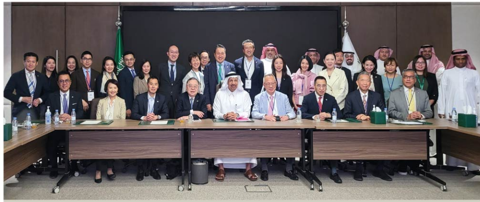
The BHKF delegation met with HE Khalid Al-Falih (seated, middle), Minister of Investment of the Kingdom of Saudi Arabia, in May 2023