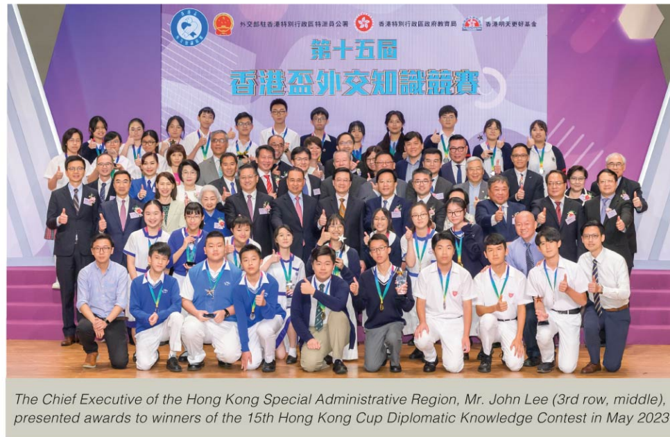
The Chief Executive of the Hong Kong Special Administrative Region, Mr. John Lee (3rd row, middle), presented awards to winners of the 15th Hong Kong Cup Diplomatic Knowledge Contest in May 2023

Tel: 852 2861 2622 | Fax: 852 2861 3361 | Website: www.betterhongkong.org | Email: mailbox@betterhongkong.org