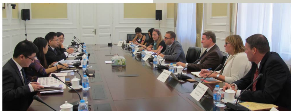
American journalists exchanged views with Chinese experts during a Beijing visit

The BHKF believes in the power of collaboration to promote Hong Kong's story and strengthen ties with mainland China and the world. Through organizing annual delegations to different countries and engaging with senior government officials and business leaders, the BHKF pursues common interests and explores potential collaborations. These delegations serve as platforms to share the latest developments concerning Hong Kong and mainland China while fostering exchanges between stakeholders in different arenas.