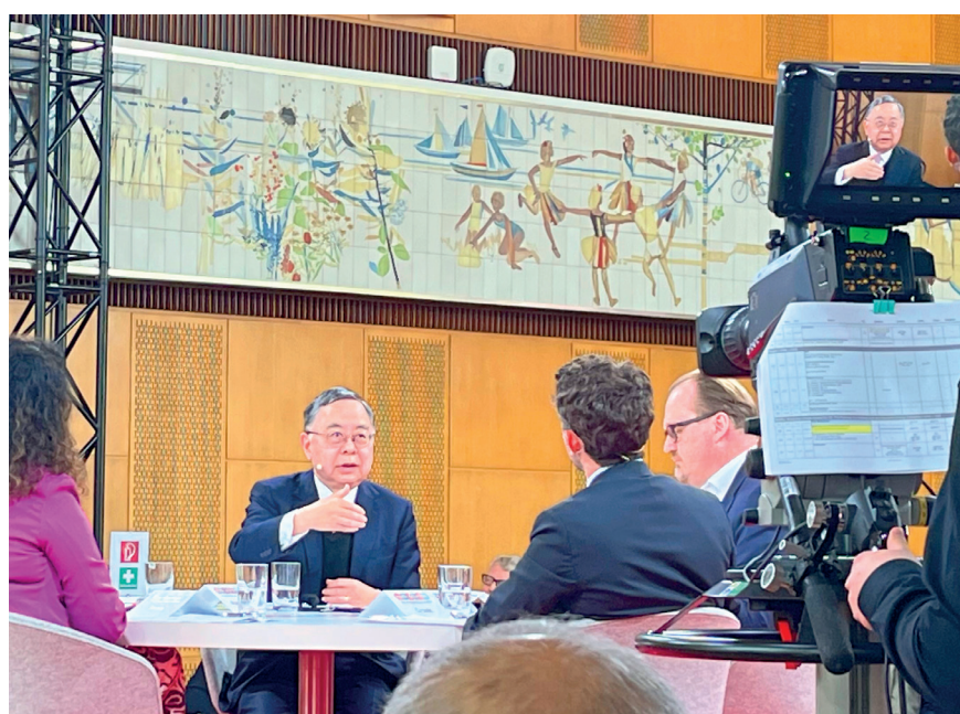
Mr Ronnie Chan, the Better Hong Kong Foundation's Executive Committee Chairman, shared his views on global cooperation at the Global Solutions Summit in Berlin in May.