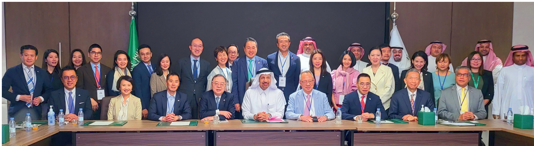
The Better Hong Kong Foundation's delegation met with HE Khalid Al-Falih (seated, middle), Minister of Investment of the Kingdom of Saudi Arabia, in May.